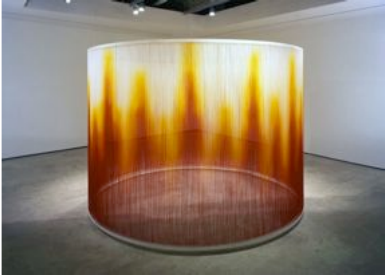
Teresita Fernández, Fire , 2005, silk yarn, steel armature, epoxy, 96 x 144 (diameter) inches.

Fernández is best known for her prominent public sculptures and unconventional use of materials. Her work is characterized by an interest in perception and the natural world. Diverse in materials and wide-ranging conceptually, Fernández creates experiential, large-scale works that are often inspired by landscape and place as well as diverse historical and cultural references. As one ARTFORUM writer put it in a review of the artist's 2010 exhibition at the Blanton Museum of Art in Austin, TX, her works focus on "an interest in opacity, transparency and the psychology of looking."