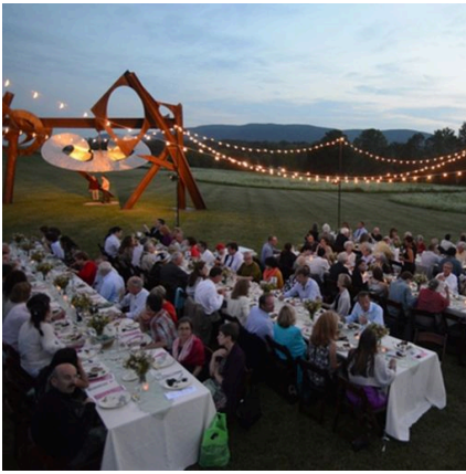
Mark di Suvero. Beethoven's Quartet , 2003. Steel, stainless steel, 24' 7" × 30' × 23' 3." Courtesy Sidney E. Frank Foundation. © Mark di Suvero, courtesy of the artist and Spacetime, C.C. Photography by Benjamin Lozovsky/Billy Farrell Agency.