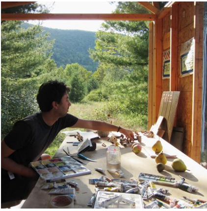
Artist working in The Shandaken Project Studio.