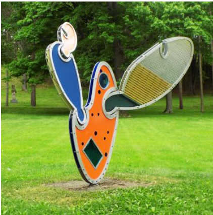
Dennis Oppenheim, Architectural Cactus #6 , 2008. Aluminum sheet, composite aluminum, diamond plate aluminum, colored corrugated aluminum, acrylic, fiberglass grating, galvanized steel base, stainless steel hardware. 9 x 6 x 8'. Gift of the Watermill Center, New York, NY.

This year, Storm King Art Center announced its first-ever artist residency program, in partnership with the Catskills-based Shandaken Project. The Shandaken Project at Storm King awarded 17 residencies for the season (June through September). The inspirational setting of Storm King Art Center and intimate scale of the on-site housing will allow for intense focus on individual practice and encourages dialogue between residents. The 17 artists chosen for this season’s residency work across the disciplines of video, photography, performance, sculpture, poetry, and critical writing. They were selected from a large pool of applicants who responded to an open call. Each artist selected a two- to six-week-long residency. The 2015 residency opens June 15 and runs through September 27. For more details, visit: http://www.stormking.org/artistresidence-html/