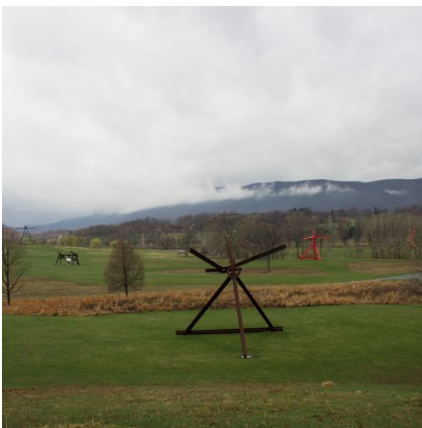
View of the South Fields at Storm King Art Center, All works by Mark di Suvero.

Dennis Oppenheim’s Architectural Cactus #6 (2008) is now on view at Storm King in the Art Center’s North Woods. As evidenced in this work’s title, Dennis Oppenheim had a deep interest in both architecture and cacti. He noted that he liked that cacti were both soft and hard, he liked the unpredictable shapes into which they grow, and he liked their prickly nature. Oppenheim created eighteen sculptures in his “Architectural Cactus” series, in six different shapes. The surface of each is designed in various colors and materials, so each sculpture is unique. The series was first produced as a public artwork for a location in the desert landscape of Scottsdale, Arizona. Its site across from a police station led Oppenheim – an artist whose work was frequently off beat and humorous – to design these cactuses to suggest puzzle pieces fit together, like the clues that detectives piece together in the process of solving a crime. Architectural Cactus #6 will be on view indefinitely at Storm King Art Center.