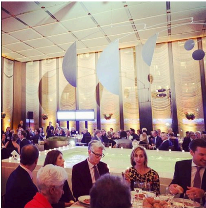
Storm King Art Center's 2014 Gala hosted at the Four Season in New York City.