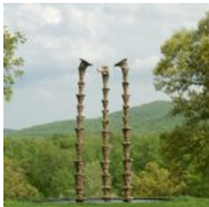
Lynda Benglis. Bounty, 2014. Private collection. Fruited Plane, 2014. Courtesy the artist and Cheim & Read, New York. Amber Waves, 2014. Courtesy the artist and Cheim & Read, New York. © Lynda Benglis / Licensed by VAGA, New York, NY.