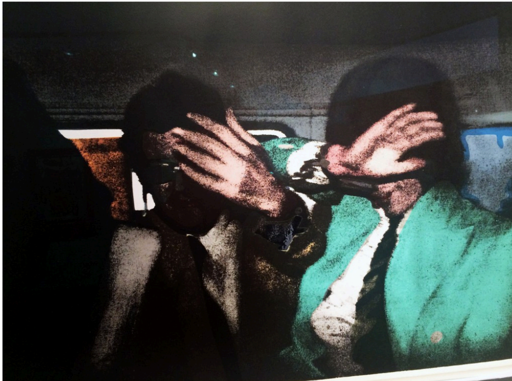
A work by Richard Hamilton