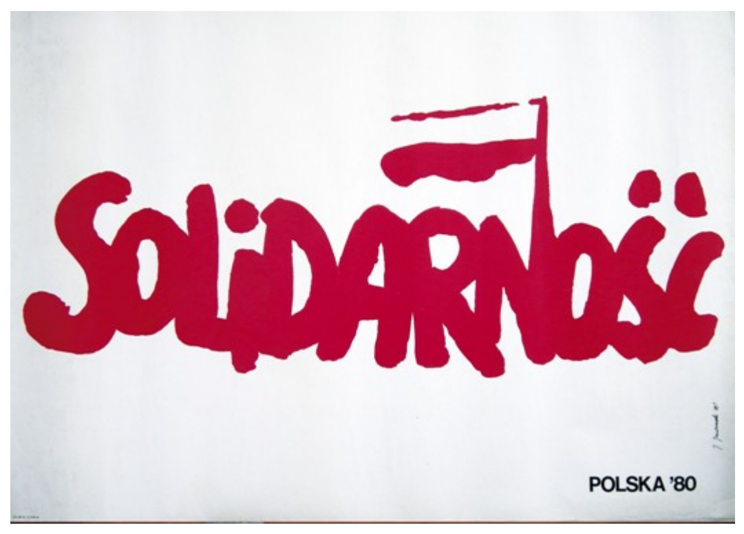
Jerzy Janiszewski / Solidarity Poster / 1980 / 39.4 x 27.6 in.

Contrasting this mood is the work of Janiszewski, a Polish graphic designer best known for designing the logo of the Solidarity trade movement. Krause notes that this logo is, "one of the 20th century's most important graphic designs," and original examples can be found in major museums throughout the world (a rare, early print from the artist's archive could be yours!). The contemporary sculptures of K M Ramich, commenting on the gun control debate, prove that art continues to be politically relevant in the 21st century.