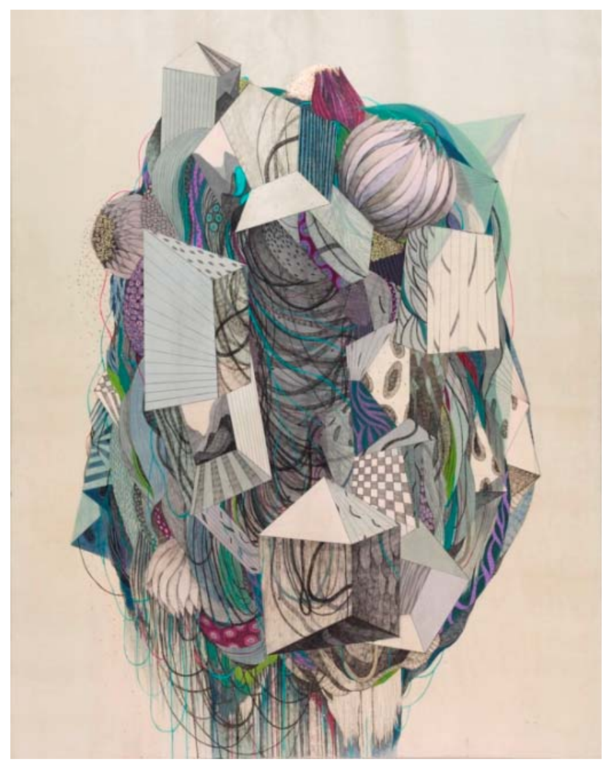
SI Jae Byun / Wind #3 in Jungle / 2013 / 46 x 36 in.

While their first room is an intimate, two-artist exhibition, their second space will be a riot of creativity with an "8 by 8" show featuring works on paper measuring up to 8 x 8 in from over 100 of their member artists. Blair describes it as a "flat file on the wall" and is sure to be a heady mix of themes and imagery!