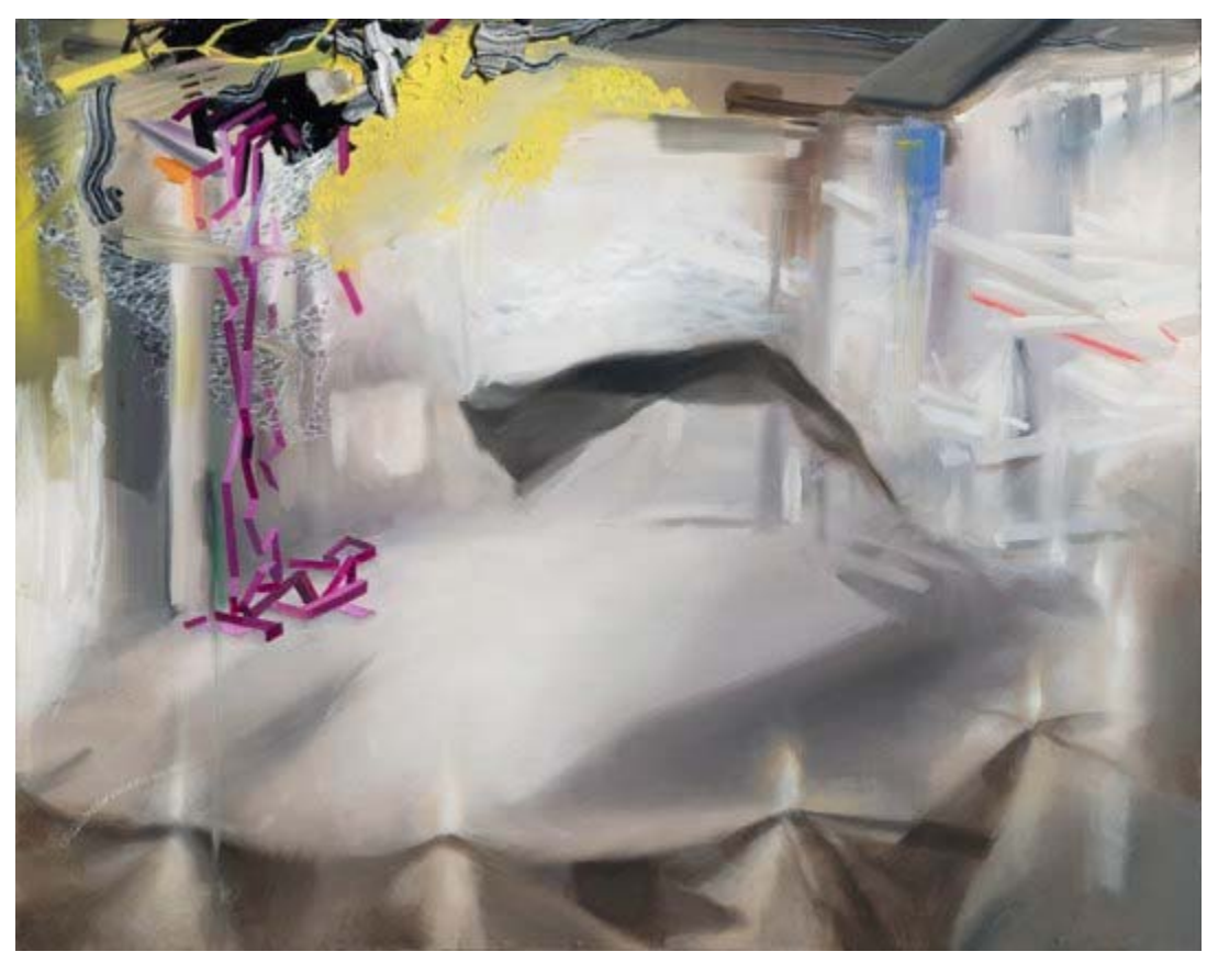
Ali Miller / Self-Sufficient / 2013 / Oil, acrylic, and quartz on panel / 11 x 14 inches

In addition to organizing the whole weekend, CONNERSMITH will be showcasing the work of Ali Miller, a 2012 MFA graduate from MICA. Miller's work – lush, painted abstracts with a wry nod to electronic media - were featured by CONNERSMITH during its Academy 2012 show last July.