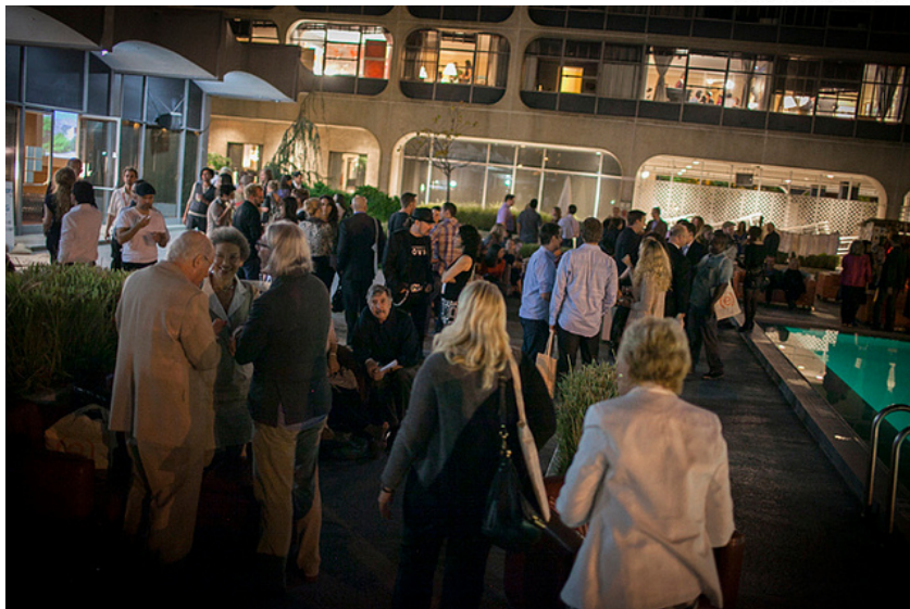
DAKOTA FINE FOR BYT