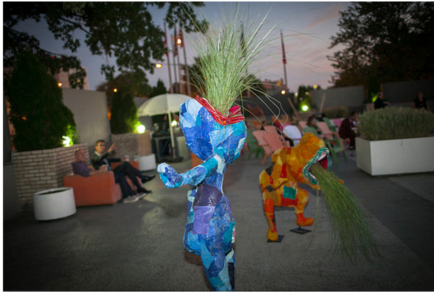
DAKOTA FINE FOR BYT