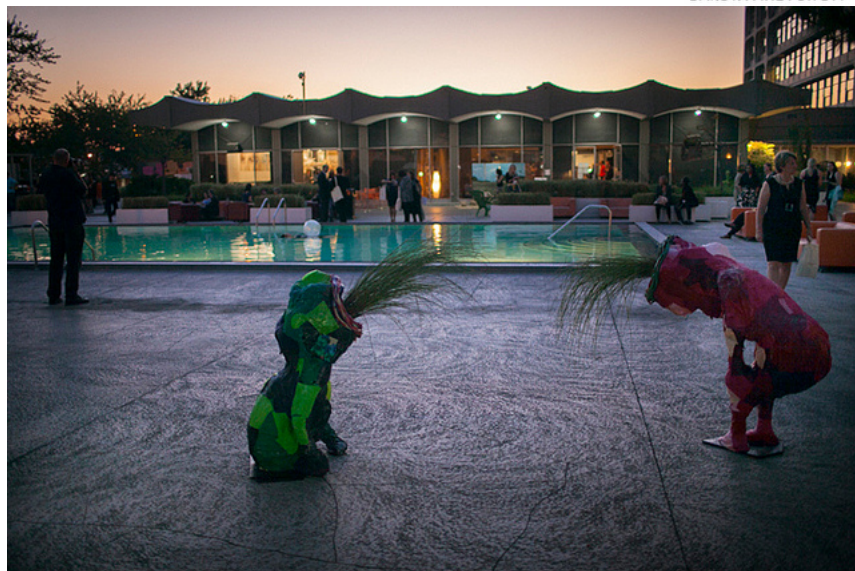
DAKOTA FINE FOR BYT