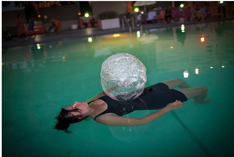
DAKOTA FINE FOR BYT