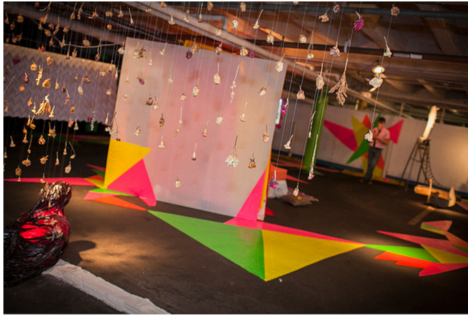
DAKOTA FINE FOR BYT