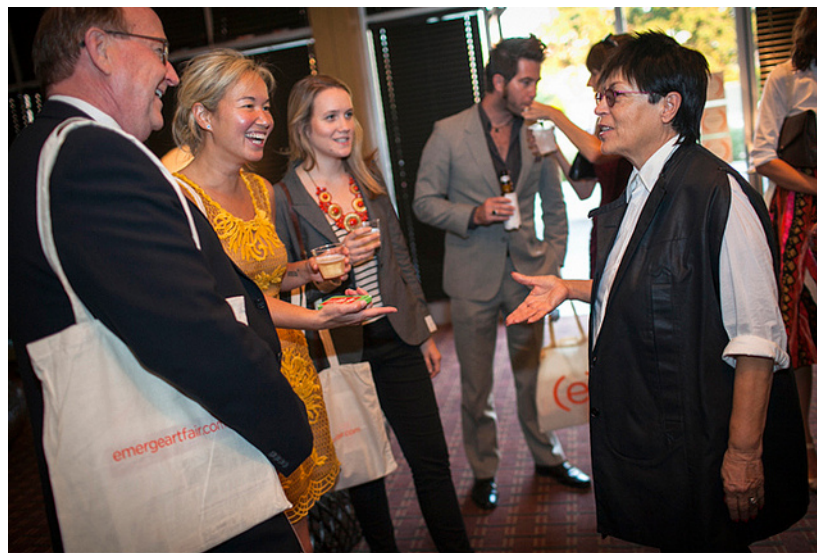
DAKOTA FINE FOR BYT

The ground floor is obviously the epicenter of both socializing, meeting with the partners of the fair and a location of some of the more high profile installations and the panels which will be happening throughout the weekend