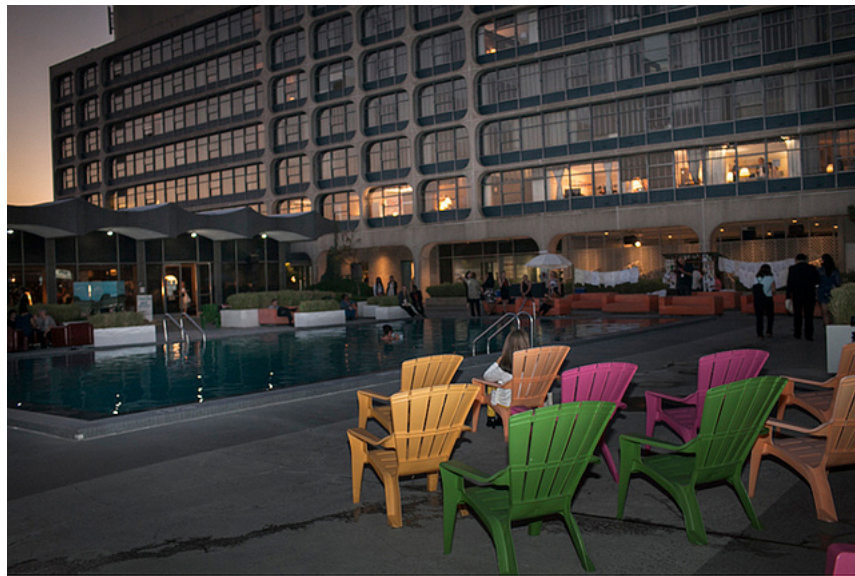
DAKOTA FINE FOR BYT