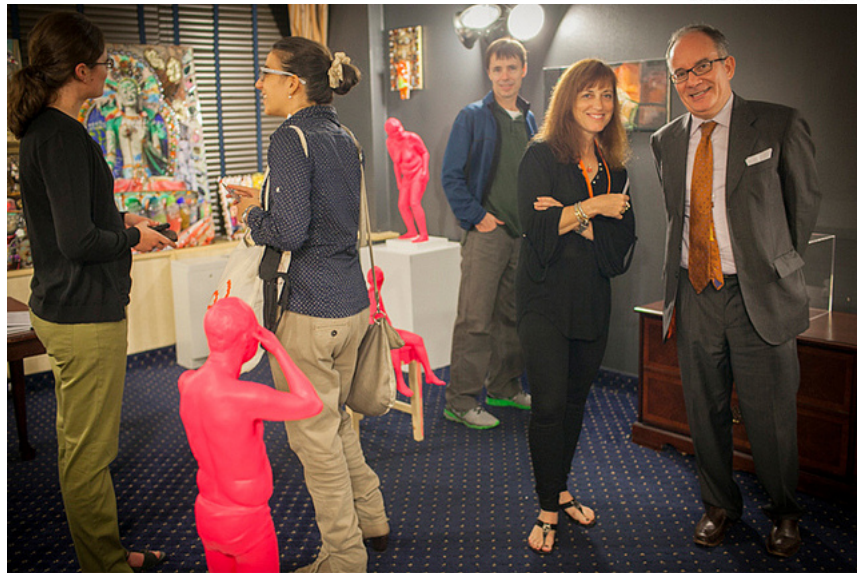
DAKOTA FINE FOR BYT