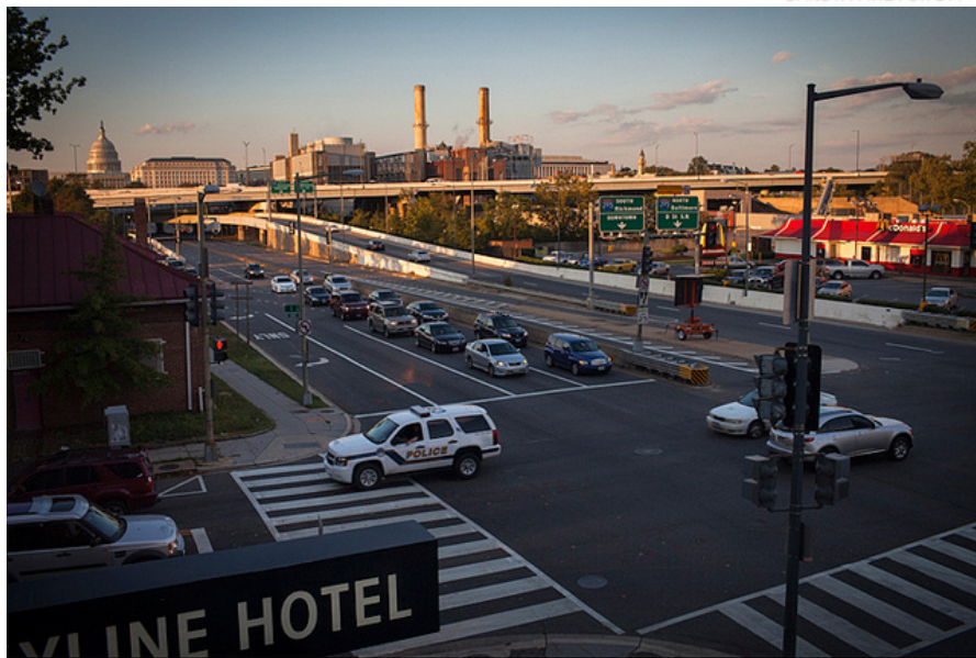
DAKOTA FINE FOR BYT