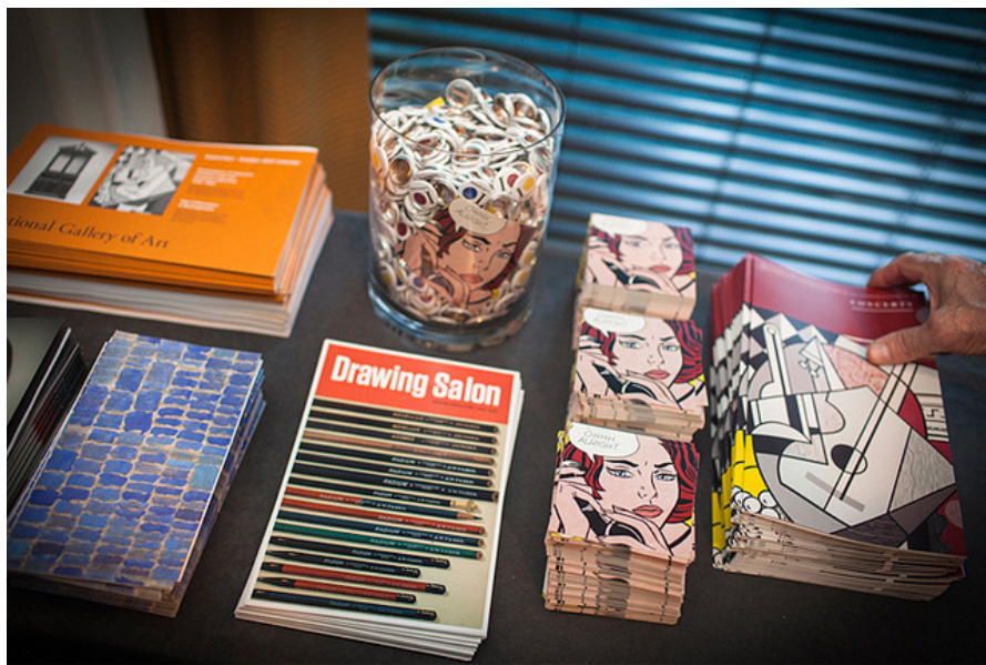
DAKOTA FINE FOR BYT