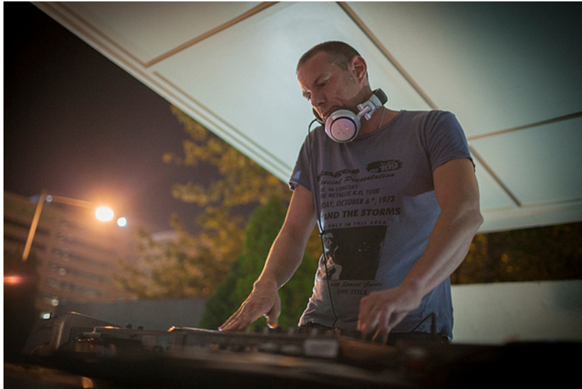
DAKOTA FINE FOR BYT