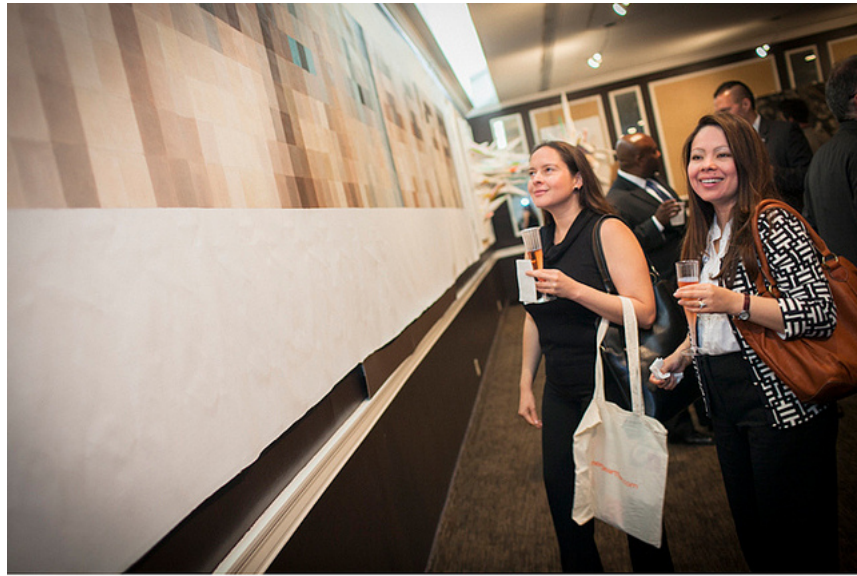
DAKOTA FINE FOR BYT