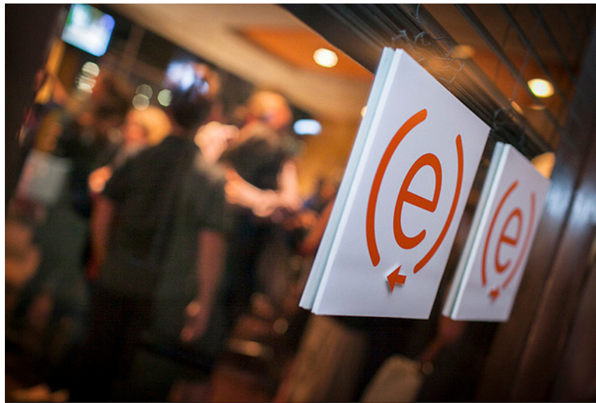
DAKOTA FINE FOR BYT