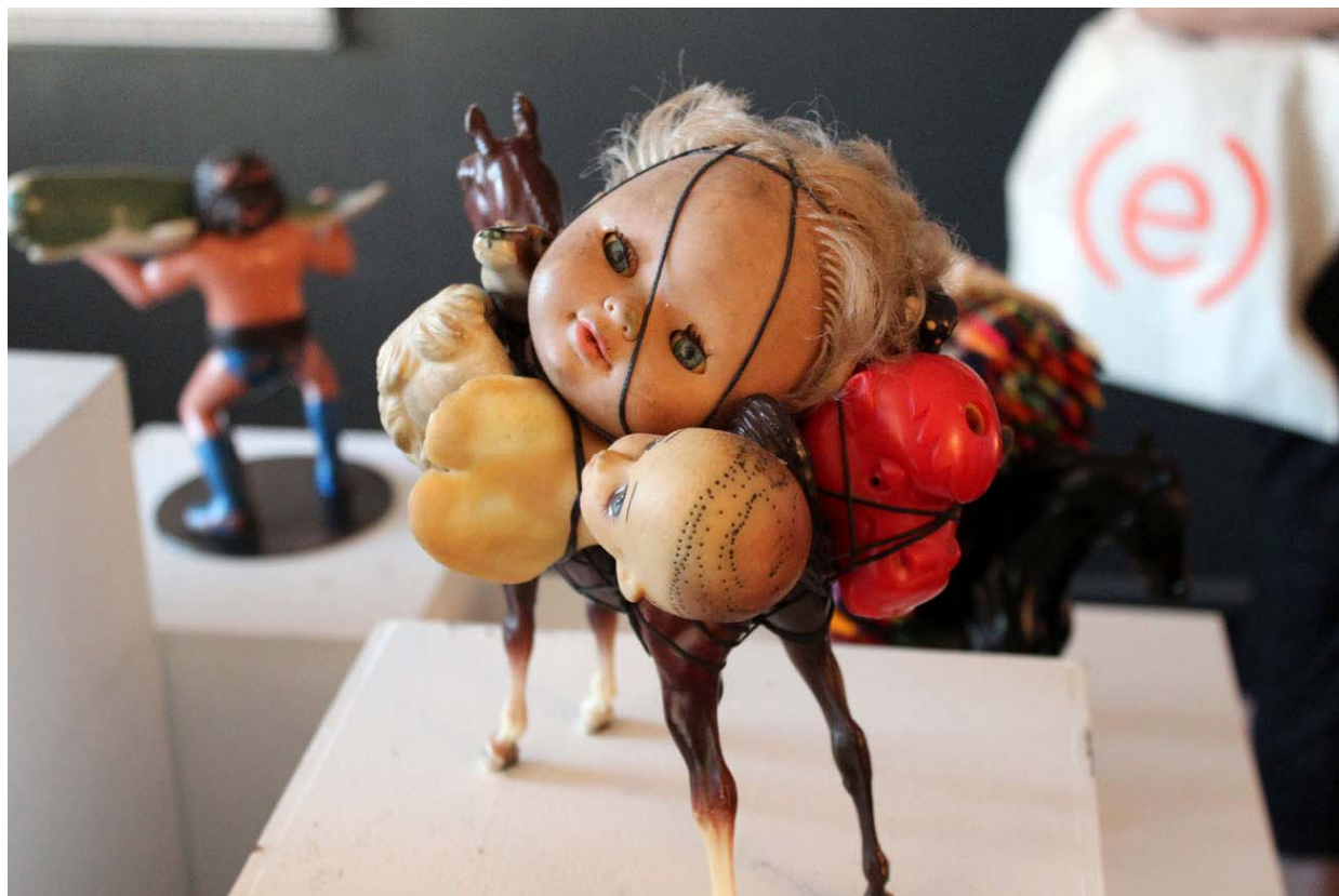
From the Packhorse series by Peter Cole at Aureus Contemporary of Basel, Switzerland.

WASHINGTON, DC — Marking its third year, the (e)merge art fair is showcasing up-and-coming artists from the Washington region and around the world. Hosted by the Capitol Skyline Hotel, the fair takes its cue from satellite shows that have popped up in recent years alongside major international fairs such as the Armory Show in New York and Miami Art Basel, where South Beach hotels have hosted events including Select Fair and Aqua Art Fair . Small galleries and individual artists convert hotel rooms into exhibition spaces and art crowds take over the common areas of the hotels at these festive affairs.