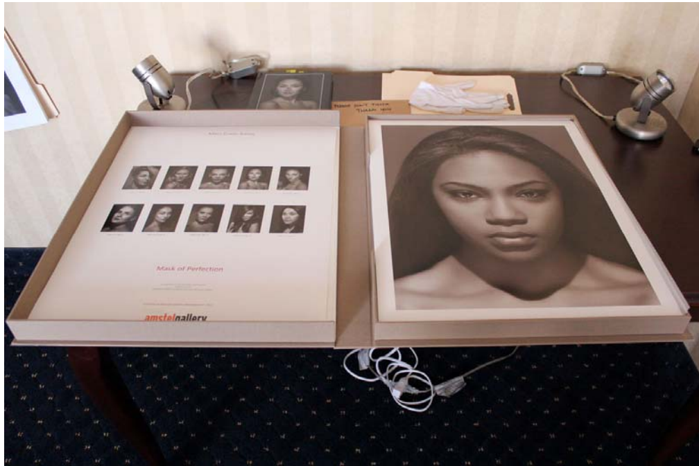
"Mask of Perfection" series by Marc Erwin Babej at Amstel Gallery of Amsterdam.

The (e)merge art fair runs from Oct. 3-6, 2013.