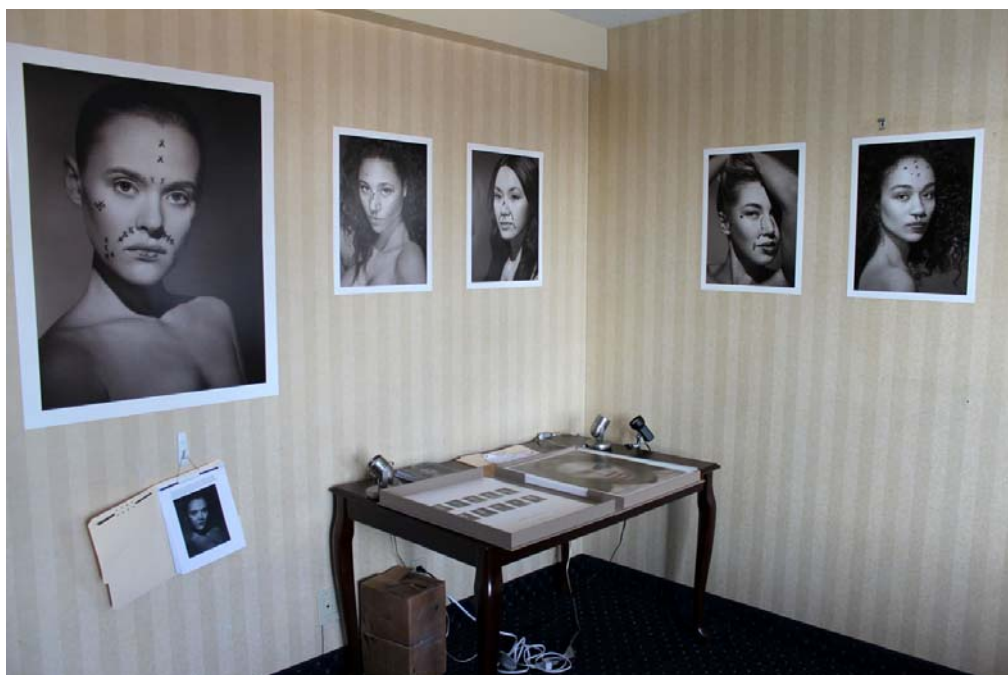
Installation view of "Mask of Perfection" series.