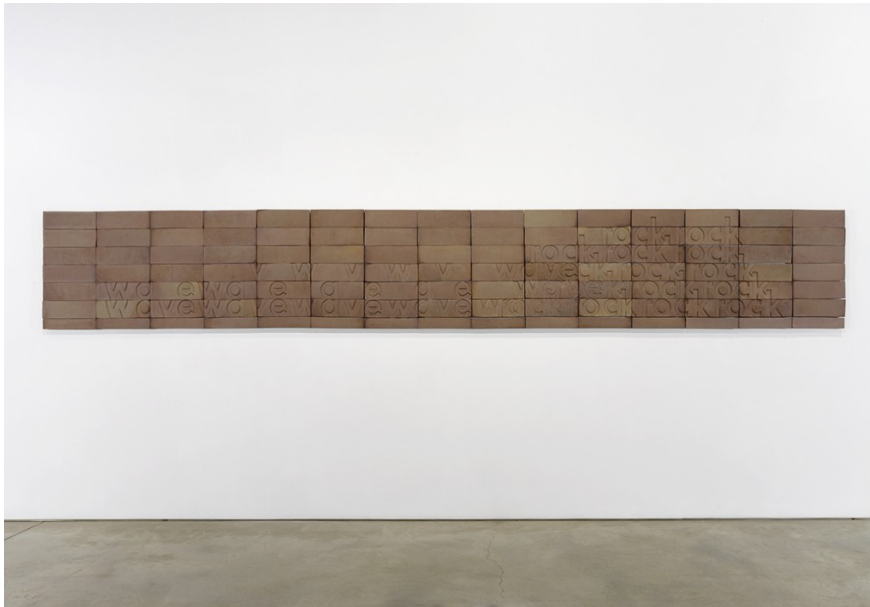
Ian Hamilton Finlay, Wave Rock, ca. 1975, 105 ceramic tiles, 29 1/2 x 200 3/4 x 5/8 inches. IF4627.

David Nolan Gallery 527 West 29th Street New York City, (212) 925-6190