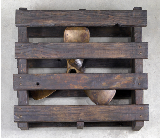
Ian Hamilton Finlay, Chrysalis , 1996, bronze, 6.3 x 21.65 x 20.08 inches, edition unique, IF0556.

adjectives forces each word to independently embody the full spectrum of its definition, and typography is always guided by mechanical fonts rather than organic handwriting, thus severing ties with subjective sentiments and demarking an abstract landscape entirely constructed from language and visual tropes. Cloud Barge (1968) illustrates this quite literally, with the words “cloud” and “barge” arranged in mirroring patterns of blue and green on two layers of Plexiglas, suspended above a kaleidoscopic field of their own refracted shadows.