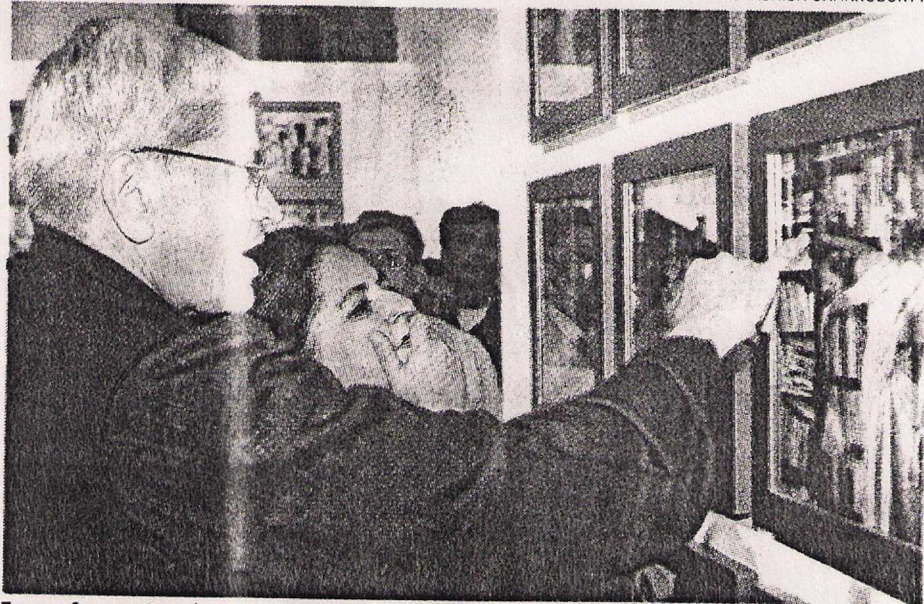
Freeze frame: Gopal Krishna Gandhi admires the photographs on Tuesday evening