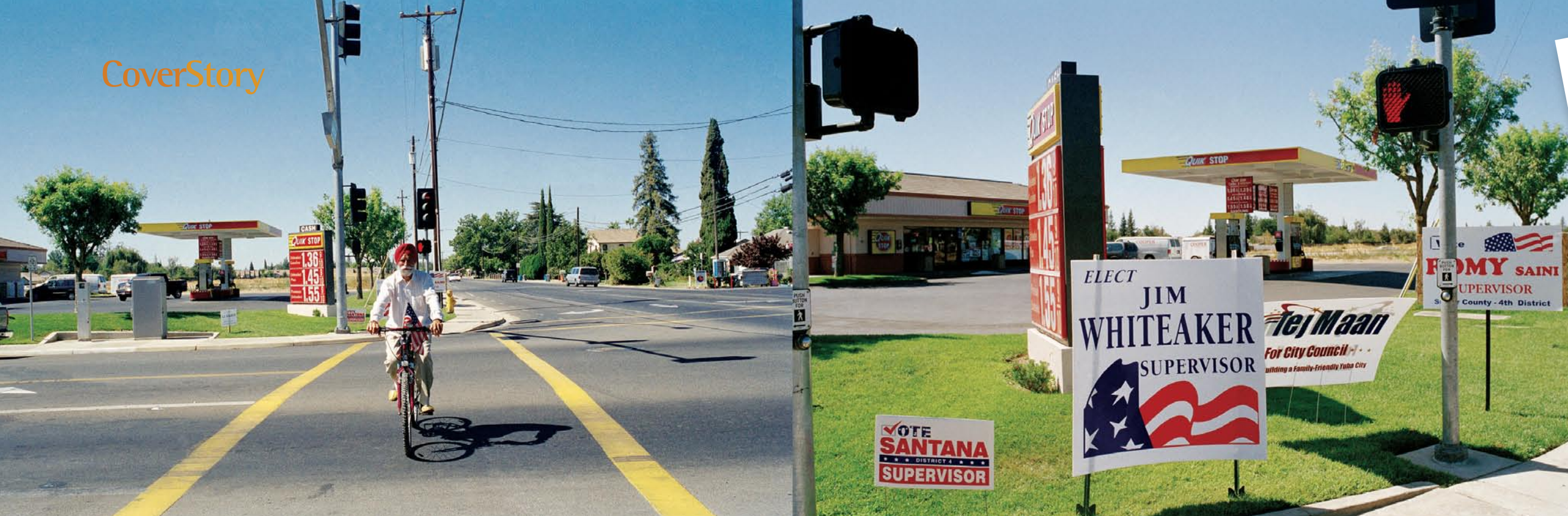
Yuba City, California 2001.

You see a well-heeled couple, IT professionals, rushing to work from their McMansion in the suburbs, each getting into their own shiny sedan, off to fulfilling their American dream.