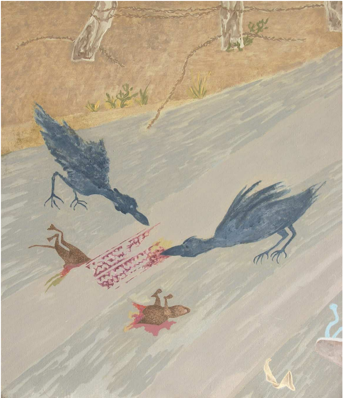
Gieve Patel, Crows with Debris , 2000, oil on canvas, 33 × 28.4 inches, collection of Bodhi Art, Inc, photo: courtesy, Bose Pacia Gallery, New York

also extend to his viewers, charging them with the task of contemplating death. For Patwardhan, however, the moral challenge is in the city itself, in its cruel moral economy that perpetuates suffering. His task as an artist is to imagine a better city in which such suffering does not have to exist. Despite this difference the mode they propose for obtaining that possible