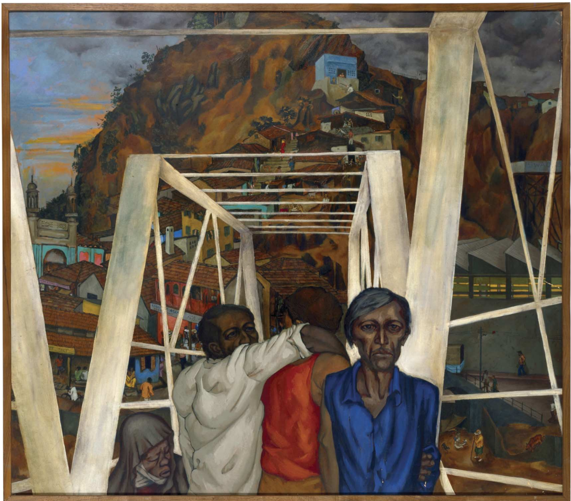
Sudhir Patwardhan, Overbridge , 1981, oil on canvas, 51 × 57 in (129 × 144.8 cm), Chester and Davida Herwitz Collection, Peabody Essex Museum, 2006 E301218, courtesy of Peabody Essex Museum