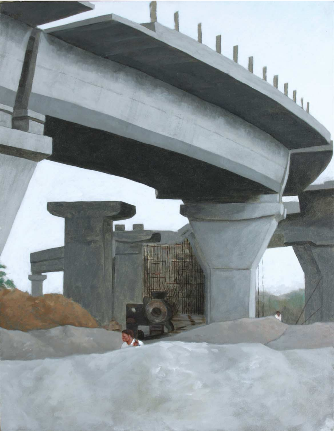
Sudhir Patwardhan, Flyover , 2005, acrylic on canvas, 24 × 18 in