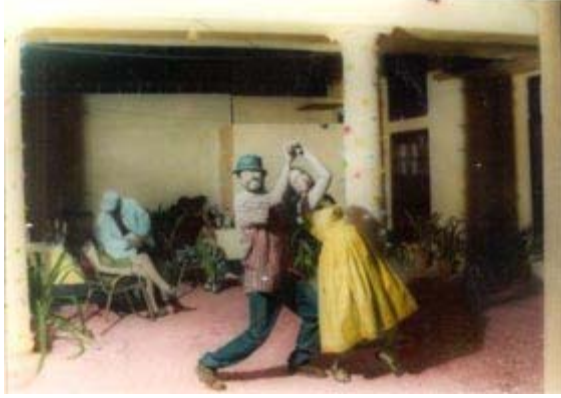
'Sunhere Sapne' 1998

Selected Exhibitions: 1994: Excavations, solo show of sculpture, Gallery Chemould, Mumbai. 1995: 100 Years of NGMA, National Gallery of Modern Art, New Delhi. Sculpture 95, Gallery Espace, New Delhi. Johannesburg Biennale, South Africa. Postcards for Gandhi, Sahmat, 6 Indian cities. 1996: Shilpayan, Contemporary Indian Sculpture, NGMA, New Delhi. The New South, London, UK. Fire and Life, Australia-India Residency [1996-97] 1997: Telling Tales. Bath Festival Trust, UK and British Council, New Delhi. 1998: Phantom Lady or Kismet, a photoromance. solo show, Gallery Chemould, Mumbai and the Artist's Studio, Bangalore, The Presence of the Past. British Council, Mumbai Khoj International Workshop, Modinagar 1999: Curated an exhibition of large site-specific works, Sthala Puranagalu, in Bangalore, Art from India, Patricia Correia Gallery, Los Angeles Biennale, USA; 2000: Open Circle International Workshop, Mumbai; 2001: Century City, Tate Modern, London, UK; Golden Dreams, photographs, solo show, Gallery Chemould, Mumbai; Moving Ideas, Hoopoe Curatorial, Canada; Khoj International Residency, New Dehi