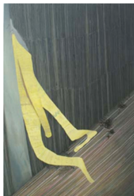
Håvard Homstvedt Wall 2006 Kantor/Feuer Gallery