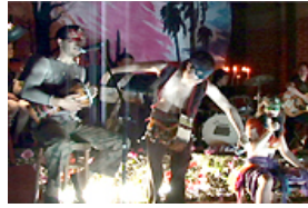
My Barbarian Pagan Rights 2005