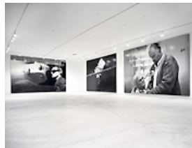
"Dennis Hopper: A Survey" at Ace Gallery Los Angeles, installation view