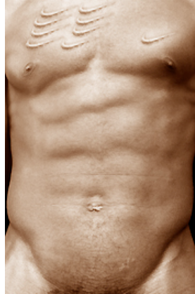
Hank Willis Thomas Scarred Chest 2003 "2006 California Biennial"