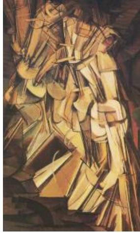
Marcel Duchamp, "Nude Descending a Staircase (No. 2)," 1912. Oil on canvas, The Louise and Walter Arensberg Collection, Philadelphia Museum of Art. 1950-134-59.