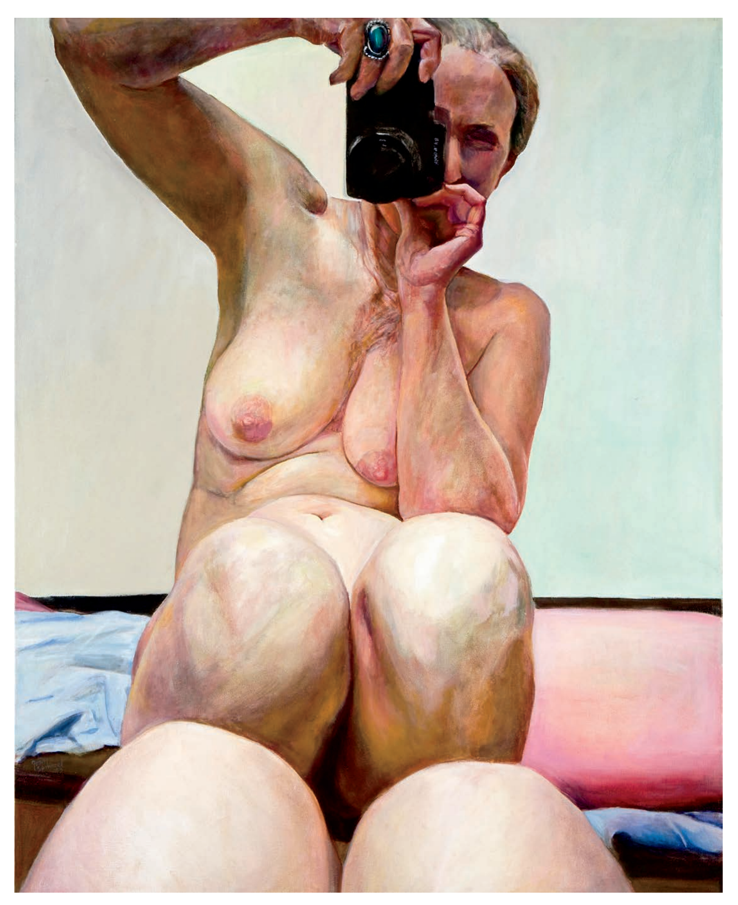
Left: Joan Semmel, Knees Together, 2003, oil on canvas, 60 x 48". From the series "With Camera," 2001–2006.

Opposite page: Joan Semmel, Red White and Blue, 1973, oil on canvas, 48 x 58". From "Second Erotic Series," 1972–73.