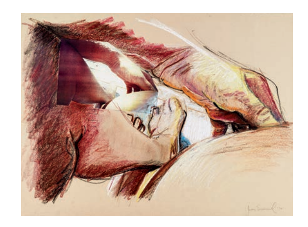
Joan Semmel, Untitled , 1978 , oil crayon and collage on paper, 22 x 30". From the series "Echoing Images," 1978–81.

The face of the artist—and with it, the specular ethos of the traditional self-portrait—is once again displaced, though now by the camera and its flash of liquid light.