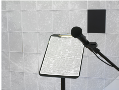
Paper Moon (I Create as I speak) (2008), installation view and detail