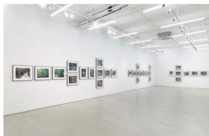
8 View of Lorraine O'Grady, Alexander Gray Associates, New York, 2015.