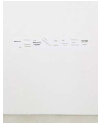
3 Lorraine O’Grady, Cutting Out the New York Times, Just the Two of Us , 1977/2010.