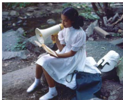
6 Lorraine O'Grady, Rivers, First Draft: A Little Girl with Pink Sash memorizes her Latin lesson, 1982/2015.