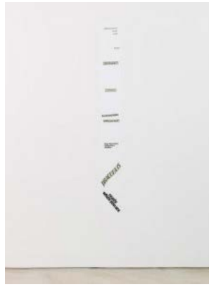
9 Lorraine O'Grady, Cutting Out the New York Times, Finding the one you love...is finding yourself , 1977/2010.