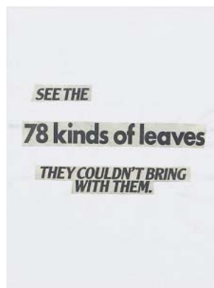
5 Lorraine O'Grady, Cutting Out the New York Times, Just the Two of Us (detail), 1977/2010.