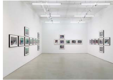
1 View of Lorraine O’Grady, Alexander Gray Associates, New York, 2015.

Utilizing a variety of performers in bright monochromatic clothing, each series illustrates distinct periods from O’Grady’s life: girlhood and young love, social and cultural pressures, encountering thresholds and becoming an artist (O’Grady in red spray-painting a stove the same color), and the final crossing of a stream guided by a man in a gray raincoat and hat wearing a costume of a small boat called The Nantucket. (O’Grady grew up in New England.) Precisely choreographed, with characters representing various symbolic figures, Rivers, First Draft tilts between the deeply personal and the universal as it evocatively charts a process of individuation. Its specific reference is the experience of a black female artist, and yet the documentation and its presentation at Alexander Gray remains open-ended enough—perhaps even, again, poetical—that the associative logic necessary for making sense of it all invites the viewer to become a retroactive participant in the work.