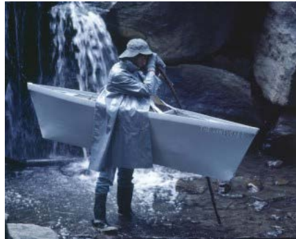
10 Lorraine O'Grady, Rivers, First Draft: The Nantucket Memorial stands motionlessly in the stream , 1982/2015.

1 View of Lorraine O'Grady, Alexander Gray Associates, New York, 2015. All images courtesy of Alexander Gray Associates, New York. All images © 2015 Lorraine O'Grady/Artists Rights Society (ARS), New York.