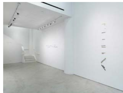
4 View of Lorraine O’Grady, Alexander Gray Associates, New York, 2015.