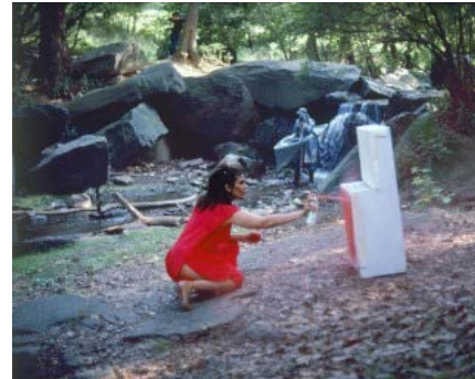
2 Lorraine O’Grady, Rivers, First Draft: The stove becomes more and more red , 1982/2015.