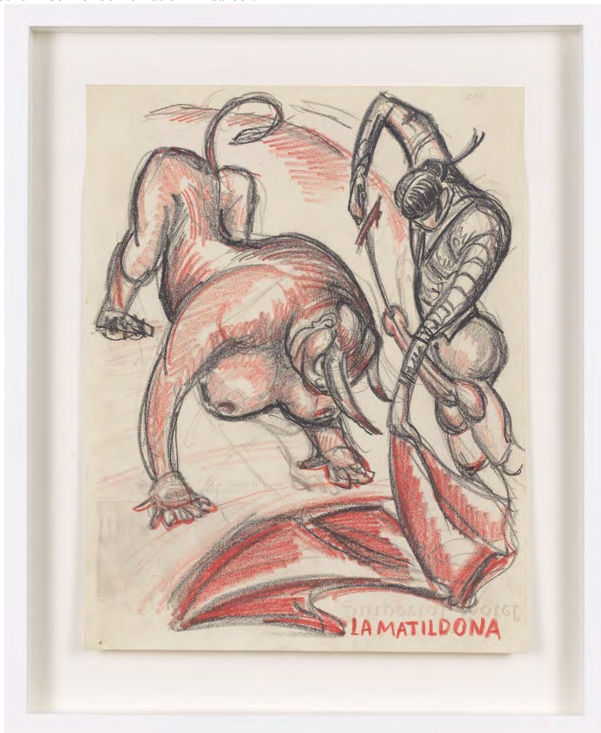
Sergei Eisenstein, "Untitled" (nd), colored pencil on paper, 10.67 x 8.27 in (private collection, image courtesy Alexander Gray Associates, New York and Matthew Stephenson, London)

men and women having sex, men with men, animals with humans, inexplicable creatures with humans, and humans with inanimate objects (masks, bottles, candelabras). Eisenstein's sex drawings are funny, violent, perverse, and sacrilegious. They're striking, immediate, and devoid of any real context with their chunky lines of black that are sometimes highlighted with red and blue. The colors recall the red flag in Battleship Potemkin or the otherworldly red and blue in Ivan the Terrible, Part Two (1958) — bright splashes in an otherwise monochromatic film career.