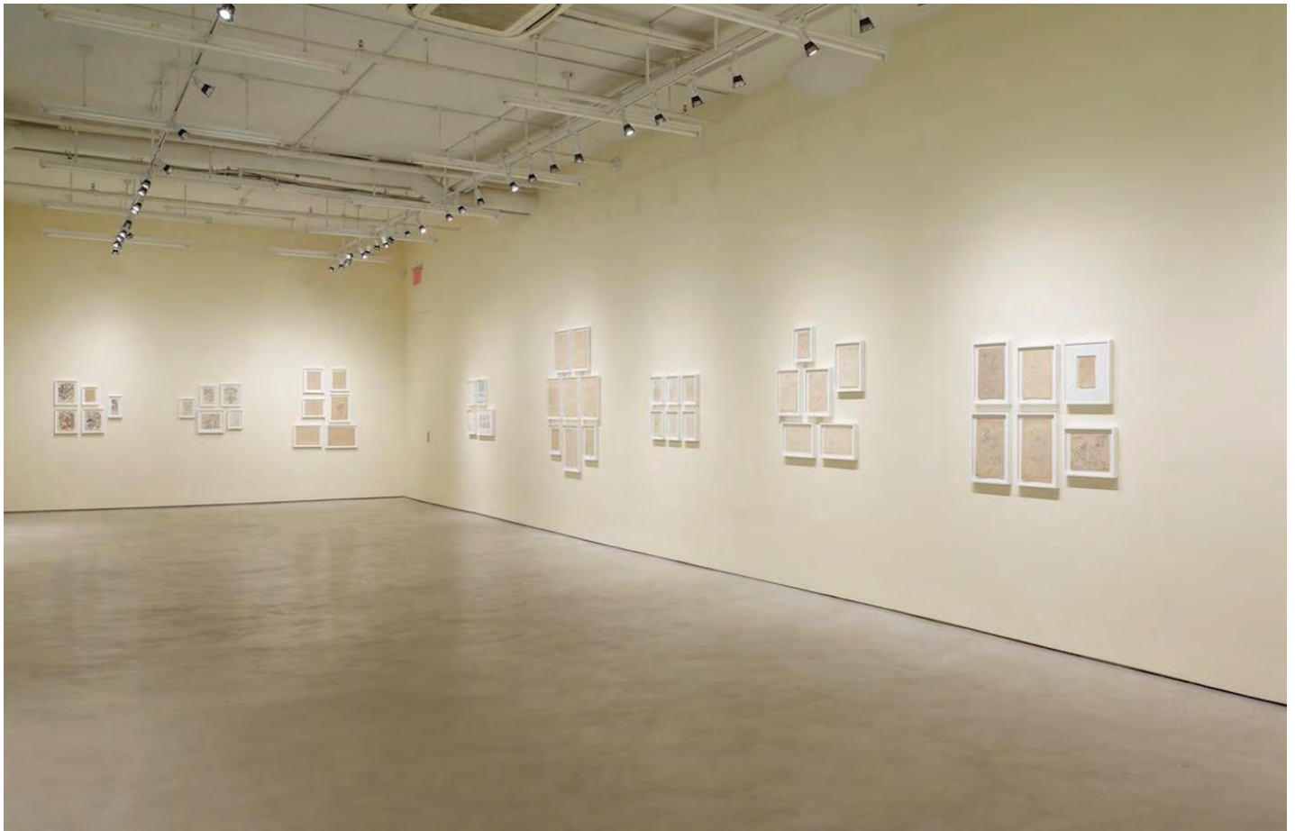
Sergei Eisenstein: Drawings 1931-1948, installation view, Alexander Gray Associates

Sergei M. Eisenstein is one of cinema's greatest theorists and directors. Battleship Potemkin and October: Ten Days That Shook the World are staples in "Film 101" college courses. So are Eisenstein's essays like, "A Dialectical Approach to Film Form" (1931) and "Methods of Montage" (1929). That word, "montage," is synonymous with the Russian director's films. He and a bevy of filmmakers that followed in his footsteps, such as Alfred Hitchcock, Jean-Luc Godard, and Brian De Palma, consider editing the essential ingredient of cinema. In Eisenstein's thinking, which was tinged with violence, individual shots are not so much as linked together, but in conflict. Montage could create a certain rhythm for a film or a certain line of thinking that Eisenstein called "intellectual montage": shot "A," the thesis, juxtaposes with shot "B," the antithesis, to create shot "C," the synthesis.