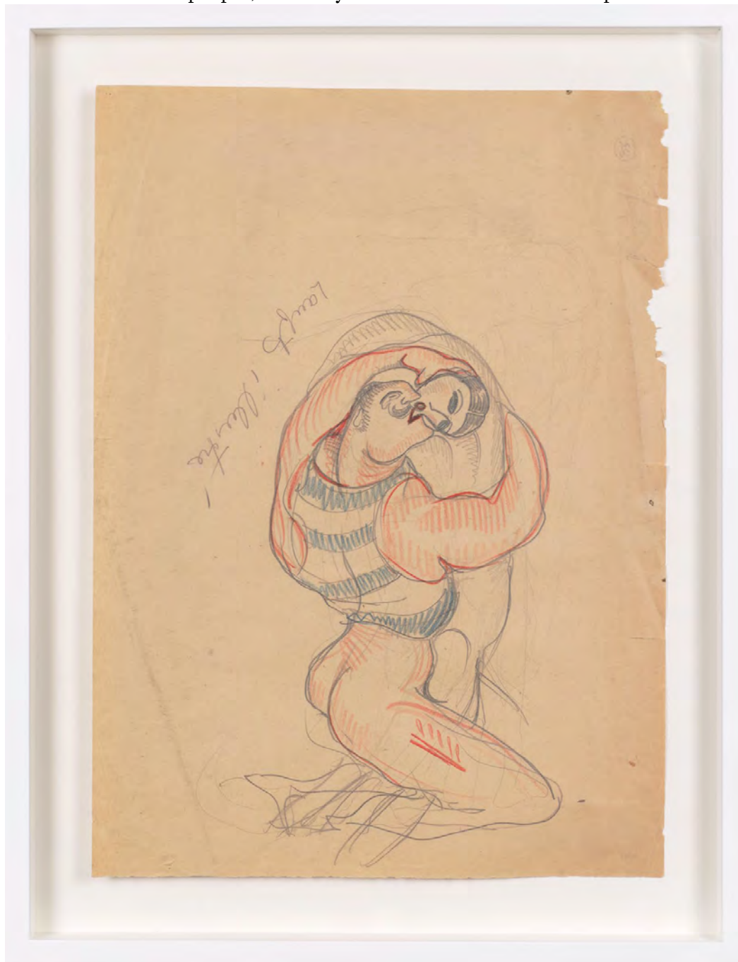
Sergei Eisenstein, "Untitled" (nd), colored pencil on paper, 14.65 x 10.63 in (private collection,)