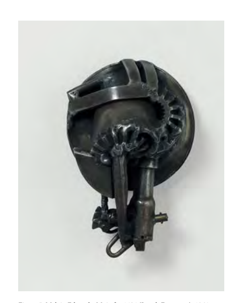
Figure 5. Melvin Edwards, Mojo for 1404 (Lynch Fragment), 1964. Welded steel. 10 \times 6 1/2 \times 4 1/2 in. (25.4 x 16.5 x 11.4 cm). Courtesy Alexander Gray Associates, New York; Stephen Friedman Gallery, London. @ 2015 Melvin Edwards / Artists Rights Society (ARS), New York. Photograph by Jeffrey Sturges.