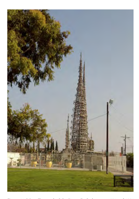
Figure 11. Watts Towers, built by Simon Rodia between 1921 and 1954.