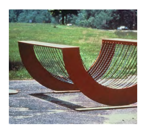
Figure 20. Homage to Coco (Rocker), 1970. Painted steel with alternating galvanized and non-galvanized chains, 48 x 96 x 120 in. (121.9 x 243.8 x 304.8 cm). Courtesy Alexander Gray Associates, New York; Stephen Friedman Gallery, London. © 2015 Melvin Edwards / Artists Rights Society (ARS), New York. Photograph courtesy the artist.