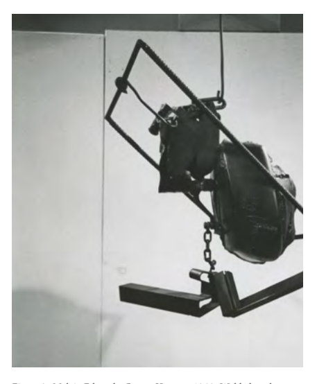
Figure 8. Melvin Edwards, Cotton Hangup, 1966. Welded steel. Central component, 26 \times 30 \times 20 in. ( 66 \times 76.2 \times 50.8 cm). Early version of work, in the artist's 1968 exhibition at the Barnsdall Art Center, Los Angeles.

CC: Or end up with stuff from that neighborhood, that other people gave you?