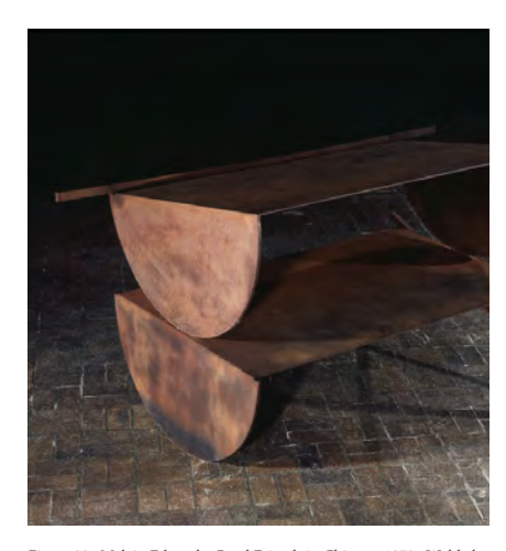
Figure 23. Melvin Edwards, Good Friends in Chicago, 1972. Welded steel, 43 x 77 3/4 x 64 1/2 in. (109.2 x 197.5 x 163.8 cm). © 2015 Melvin Edwards / Artists Rights Society (ARS), New York.

ME: I don't think it was the first time I had heard the name, but it was the first time I heard a