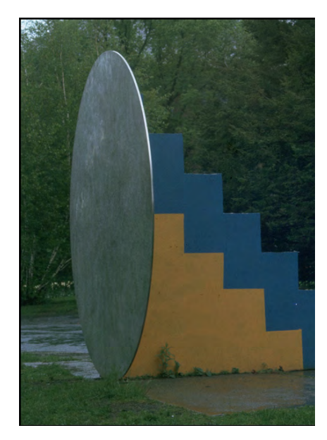
Figure 15. Melvin Edwards, Homage to My Father and the Spirit, 1969. Stainless steel and painted steel. Herbert F. Johnson Museum, Cornell University, Ithaca, New York. Acquired with funds provided by the National Endowment for the Arts, and through the generoist of individual donors.