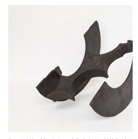
Figure 22. Melvin Edwards, Avenue B (Rocker), 1975. Welded steel, 23 3/4 x 30 1/2 x 18 1/4 in. (60.3 x 77.5 x 46.4 cm). © 2015 Melvin Edwards / Artists Rights Society (ARS), New York.