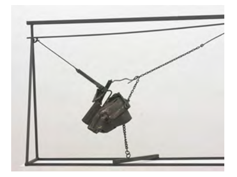
Figure 7. Melvin Edwards, Chaino, 1964, Welded steel and chains. 62 x 102 x 26 in. (157.5 x 259.1 x 66 cm). Williams College Museum of Art, Williamstown, Massachusetts; museum purchase. © 2015 Melvin Edwards / Artists Rights Society (ARS), New York.