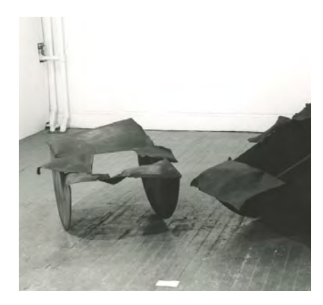
Figure 24. A Conversation with Norman Lewis, 1970. Welded steel. Two parts: 27 \times 42 \times 41 in. (68.6 \times 106.7 \times 104.1 cm) and 31 \times 43 \times 57 in. (78.7 \times 109.2 \times 144.8 cm). © 2015 Melvin Edwards / Artists Rights Society (ARS), New York.