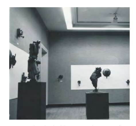
Figure 17. Melvin Edwards exhibition, Santa Barbara Museum of Art, 1965. An early version of Chaino is visible in the right corner.