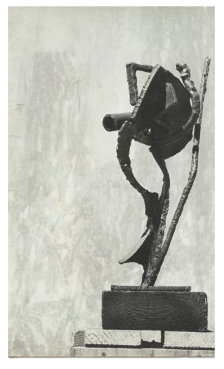
Figure 3. Melvin Edwards, Bloodflower Poet, ca. 1962. Welded steel. Private collection. © 2015 Melvin Edwards / Artists Rights Society (ARS), New York.

CC: One of the things that moves me about the early Lynch Fragments is how small they are—they're very powerful, and seem to have this enormous force packed into them.