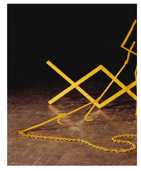
Figure 13. Melvin Edwards, Conversations with My Father, 1974. Painted steel and chain, 48 3/4 x 70 1/2 x 46 1/2 in. (123.8 x 179 x 118.1 cm). Courtesy Alexander Gray Associates, New York; Stephen Friedman Gallery, London. © 2015 Melvin Edwards / Artists Rights Society (ARS), New York. Photograph courtesy the artist.