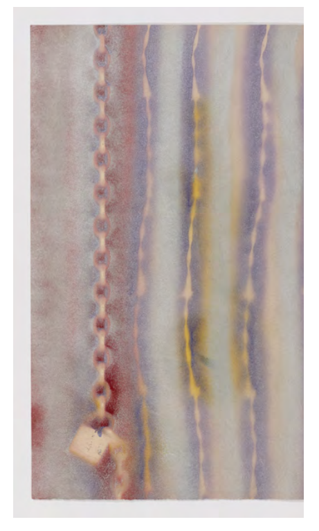
Figure 19. Melvin Edwards, B Wire Chaino B Wire, 1970. Spray paint on paper. 24 x 18 in. (61 x 45.7 cm). Courtesy Alexander Gray Associates, New York; Stephen Friedman Gallery, London. © 2015 Melvin Edwards / Artists Rights Society (ARS), New York. Photograph by Jeffrey Sturges.

I thought about it; then, when I gave him what I wrote, he didn't like me being critical of museums for not having shown African American artists' work. Not that they didn't occasionally show one or two here or there, but there were no one-man shows at museums. There was no