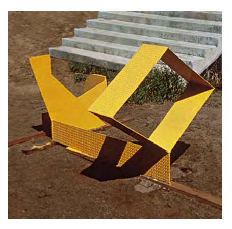
Figure 14. Melvin Edwards, Yellow Diamond, 1968. Painted welded steel. Dimensions and present location unknown. Made during summer residency at Sabathani Community Center, Minneapolis, Minnesota. © 2015 Melvin Edwards / Artists Rights Society (ARS), New York.

CC: Pyramid Up and Down Pyramid was the first piece you made from barbed wire, and it was in