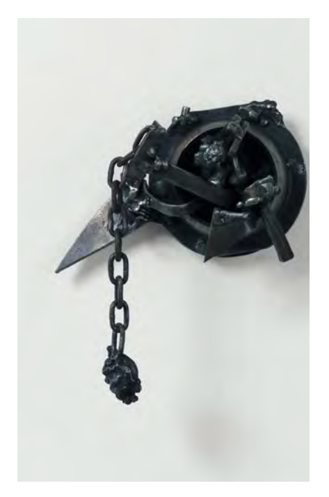
Figure 4. Melvin Edwards, Some Bright Morning (Lynch Fragment), 1963. Welded steel, 14 1/4 x 9 1/4 x 5 in. (36.2 x 23.5 x 12.7 cm). Courtesy Alexander Gray Associates, New York; Stephen Friedman Gallery, London. © 2015 Melvin Edwards / Artists Rights Society (ARS), New York. Photograph by Jeffrey Sturges.

CC: When did you start listening to jazz seriously?