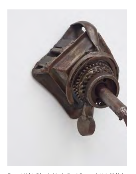
Figure 6. Melvin Edwards, Mamba (Lynch Fragment), 1965. Welded steel, 10 1/2 x 9 x 9 3/4 in. (26.7 x 22.9 x 24.8 cm). Courtesy Alexander Gray Associates, New York; Stephen Friedman Gallery, London. @ 2015 Melvin Edwards / Artists Rights Society (ARS), New York. Photograph by Jeffrey Sturges.

ME: Yeah, they're not supposed to be slack. It has the one chain that comes straight from the