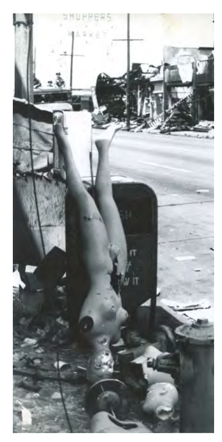
Figure 10. Central Avenue, after the Watts rebellion, Los Angeles, 1965.

I was aware of a lot of the revolutionary history of Haiti and eventually Cuba as well, of the importance of fighters recruited from the sugar cane fields, who used that, their tool, as their weapon. Plus there were variations in the form that I began to really pay attention to—those that were, say, within the iconography of Benin. Because weapons were important both as weapons