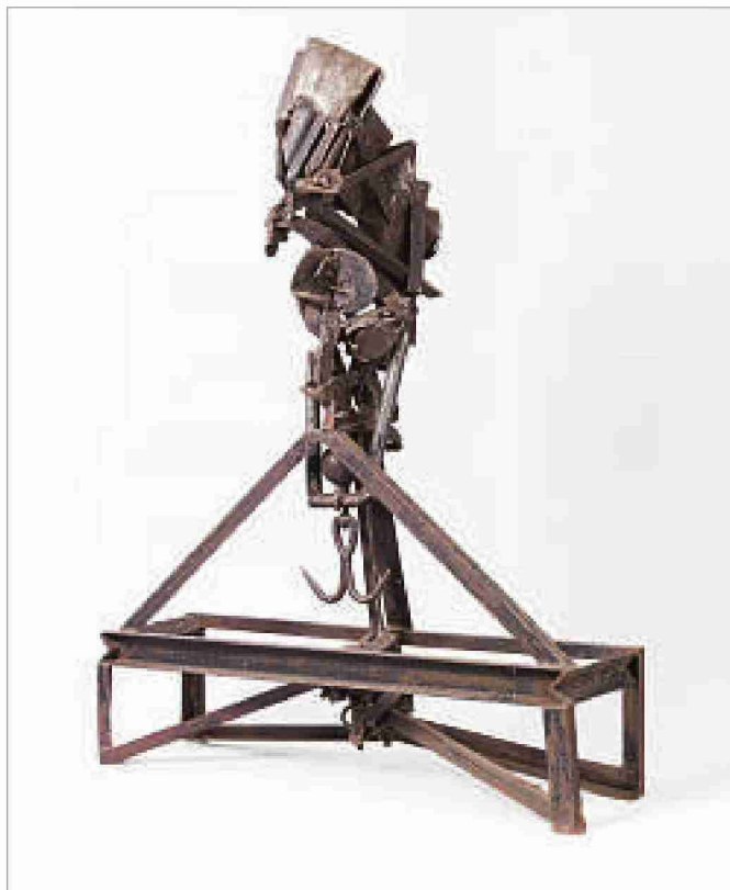
Museum of Modern Art

The Lifted X , 1965, was acquired by the Museum of Modern Art in New York last year.