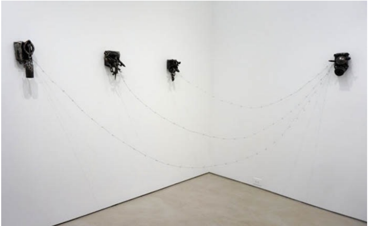
Melvin Edwards: In Oklahoma at Alexander Gray Associates.