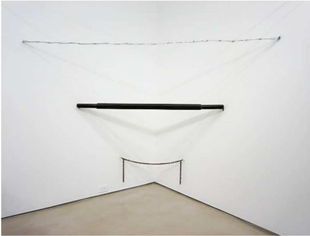
Melvin Edwards: In Oklahoma at Alexander Gray Associates.