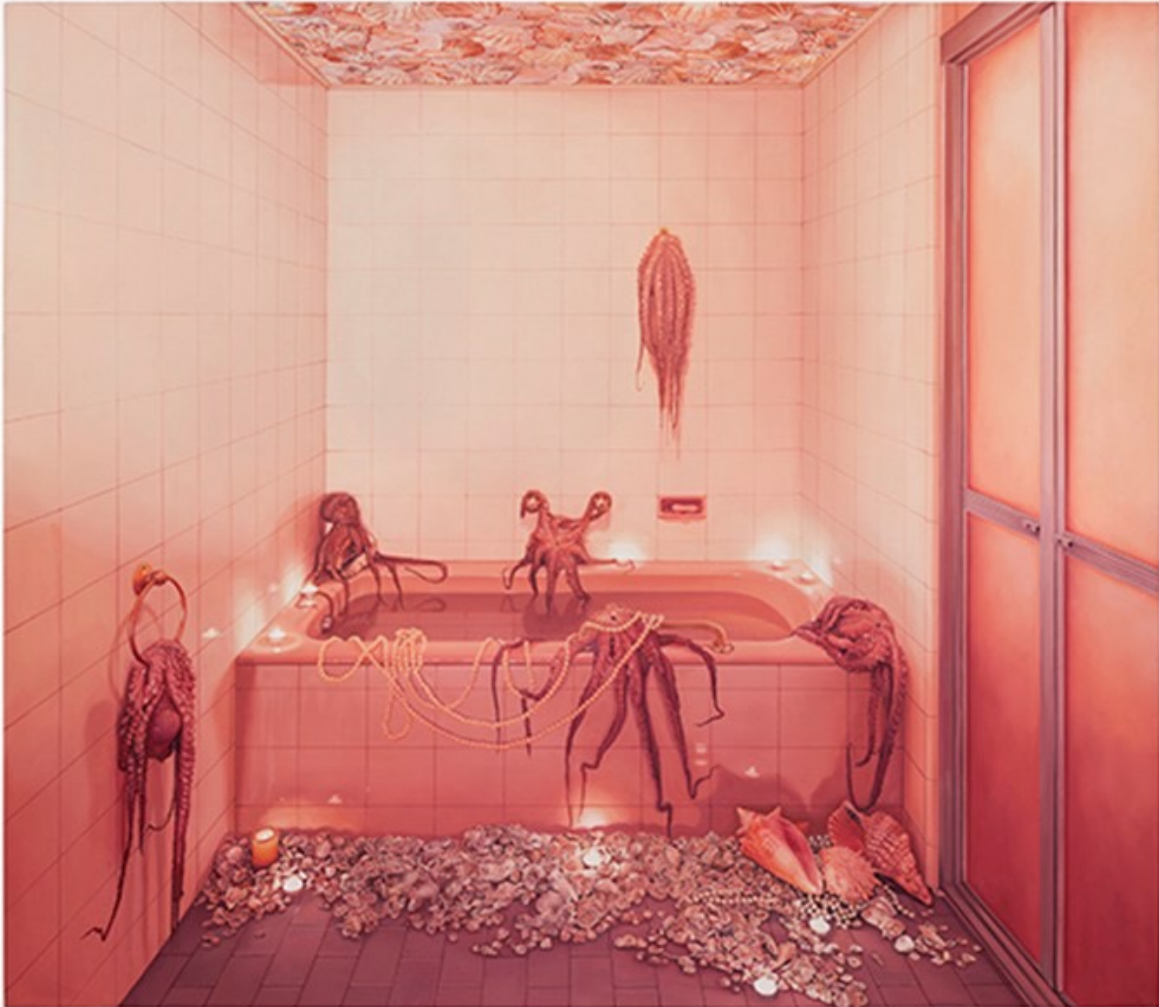
Ana Elisa Egreja, Banheiro rosa com polvos (2017). Oil on canvas. 190 x 220 cm. Courtesy Galeria Leme, São Paulo. Photo: Filipe Berndt.

For anyone keeping tabs, the relation between artworks on show at local galleries and their booths at SP-Arte was a recurring strategy. Ana Elisa Egreja's hyper-realistic oil paintings of scenes staged and photographed in her studio—from a flooded living room filled with tropical plants in Poça II [Puddle II] (2017), to a pink bathroom draped with octopuses and shells flanked by candles in Banheiro rosa com polvos [Pink Bathroom with