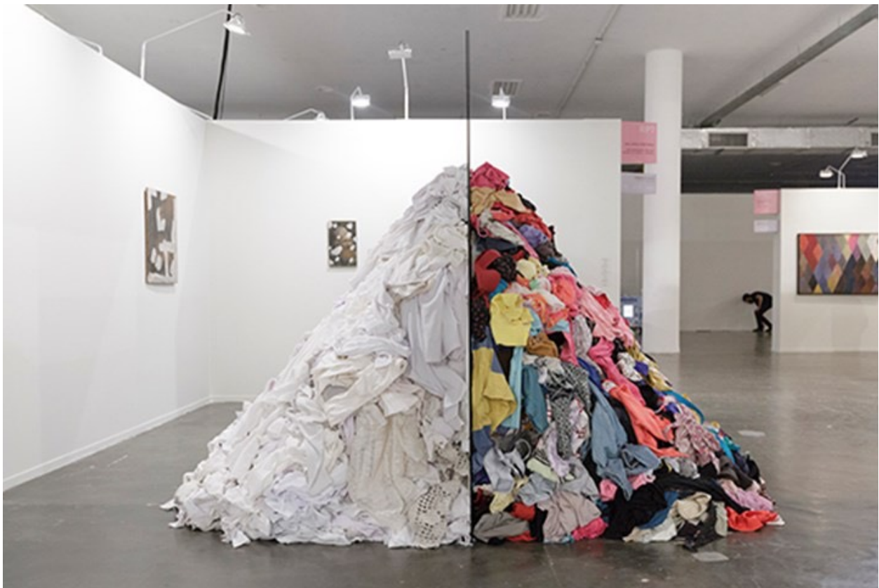
Michelangelo Pistoletto, Senza Titolo 92 [Untitled 92] (1976–2013). Mixed media. Presented by Galleria Continua at SP-Arte 2017, São Paulo (6–9 April 2017).

as paintings by Carlos Vergara, Mario Cravo Neto's mystical black and white photographs of objects and people, and Lydia Okumura's Project for a Corner Piece XI (1975), which is made from several strings hung across a black painted corner. However, the experience could have been more enriching to visitors, and possible dialogues between works made stronger, had the selection been displayed more fluidly in the same area, rather than in booth format.