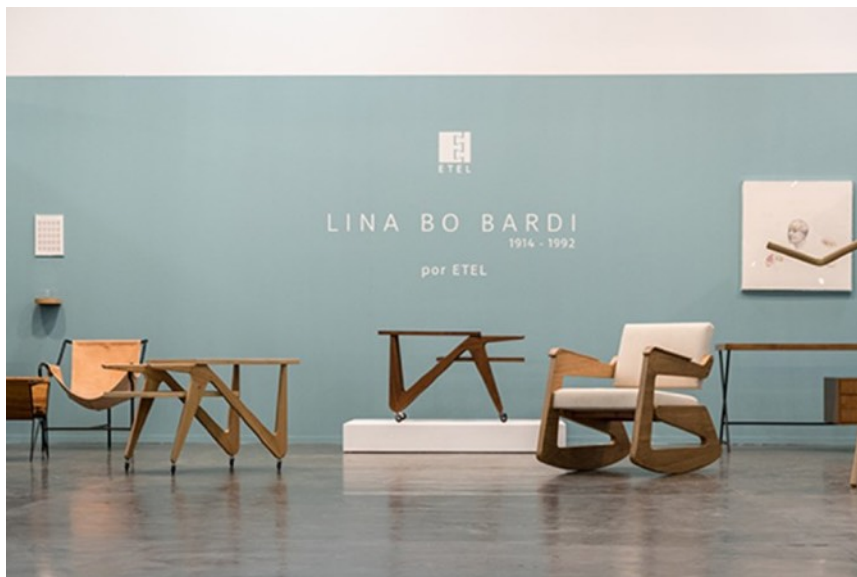
Installation view: Lina Bo Bardi, ETEL, Design sector, SP-Arte 2017, São Paulo (6–9 April 2017).