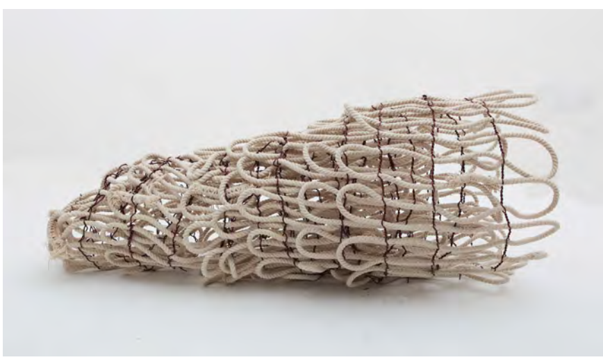
Hassan Sharif, Cotton Rope No 8, 2012, cotton rope and copper wire, 51.2h x 27.6w x 27.6d in (130h x 70.1w x 70.1d cm)