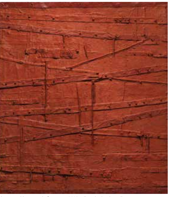
Harmony Hammond, Coverup , 2012, oil and mixed media on canvas 68.5h x 60.75w in (173.99h x 154.31w cm)