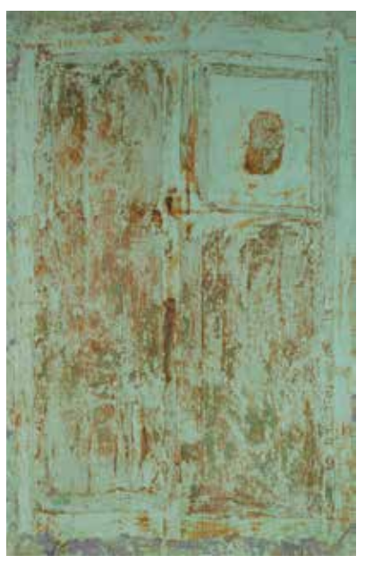
Estate of Heidi Bucher, Puerta cuartel azul verde , 1988 Latex and cotton, 86.6h x 55.1w in (220h x 140w cm)