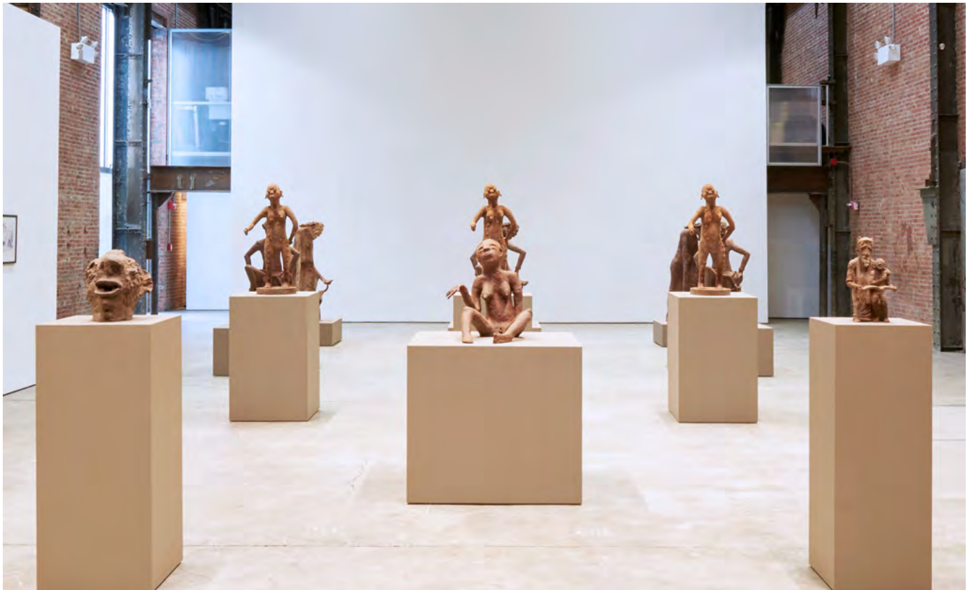
Installation view of “Cercle d’Art des Travailleurs de Plantation Congolaise,” 2017, at SculptureCenter, New York.

formulated a brilliant theoretical approach to the circulation of images, objects, and ideas, based on a model of virality, that incisively responded to the horrors of the AIDS crisis while accurately predicting the terms of our current cultural epoch. Gonzalez-Torres—continuing to interrogate in the 1990s the power of ideological packaging as his appropriation-era forerunners had done during the 1980s—tested the possibility of releasing biting social commentary into the routine channels of American consumer society, attuned to the manner in which social transgression can gain traction and circulate just below the level of consciousness. He wanted his ideas to travel. At the same time, his theory of dispersal was predicated on carefully considered conditions, which his estate has taken pains to maintain in the two decades since his death, and which we can only hope will remain safeguarded.