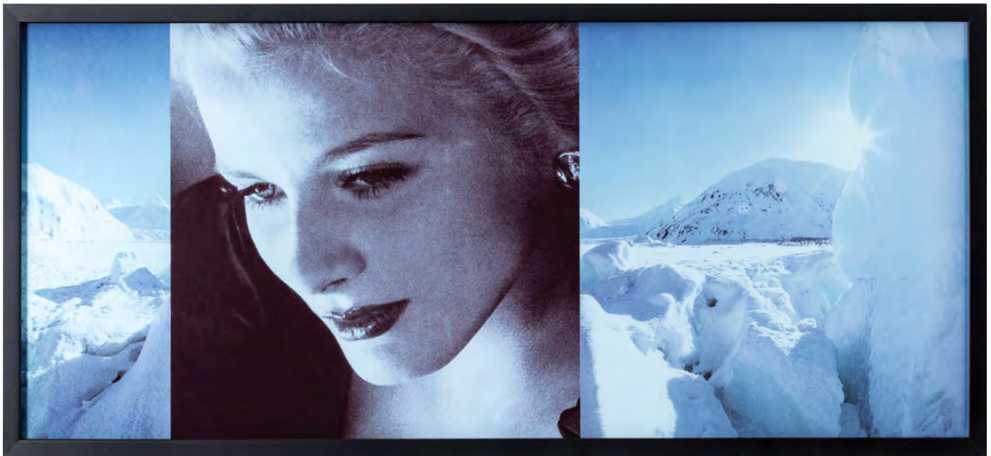
Vikky Alexander, Portage Glacier , 1982, digital print on Moab Slickrock metallic pearl acid-free paper mounted on Dibond, 18" x 40". Downs & Ross.