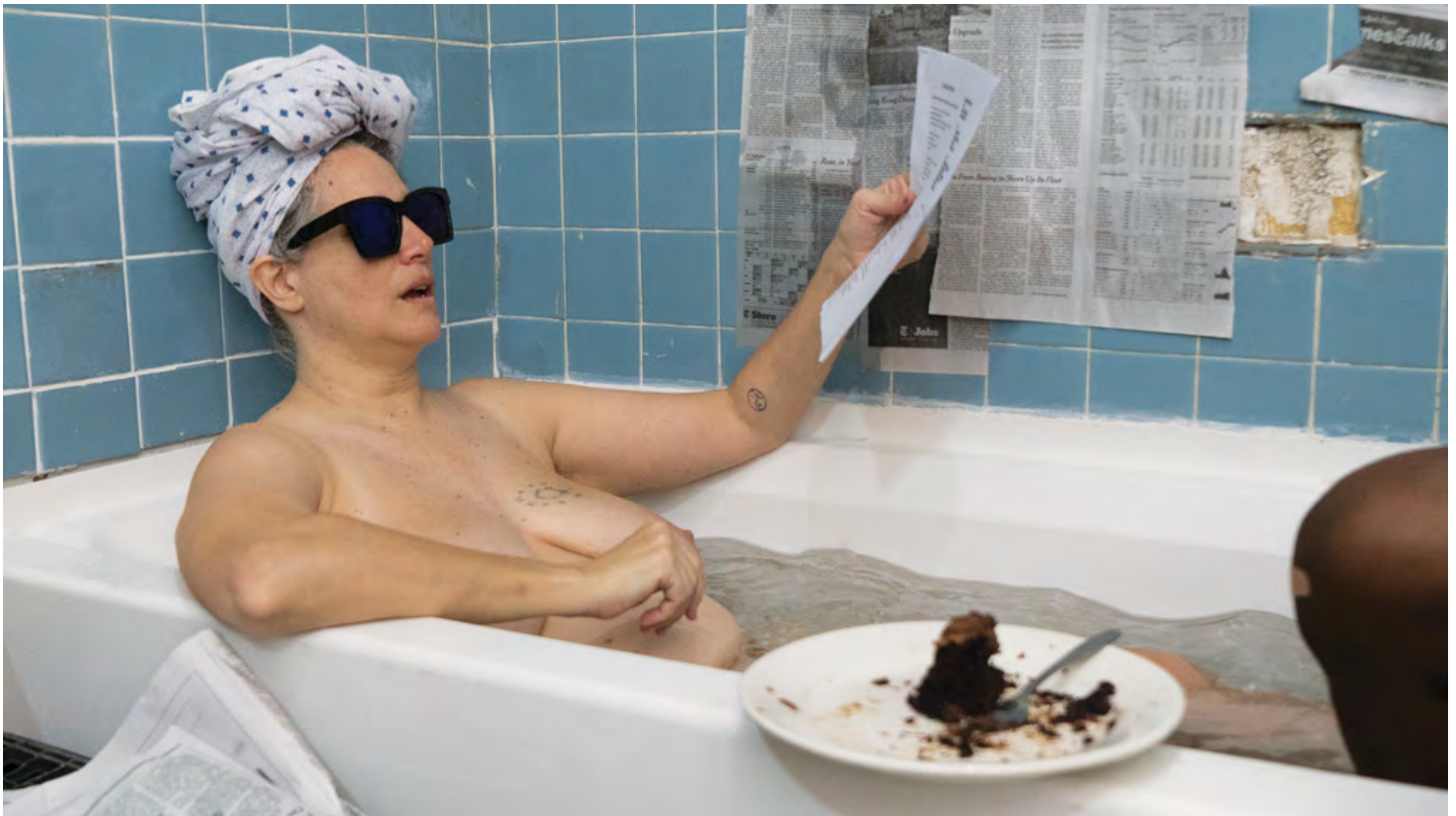
A.K. Burns, Living Room (production still), 2017–, two-channel HD video, 36 minutes. New Museum.

surface of the elevator banks. An introductory section dedicated to reworked drawings from Pettibon's childhood was a special treat, rendering the frequent museum survey teleology of the evidence of childhood "genius" into a perverse yet satisfying exaggeration. The gallery dedicated to a salon-style tiling of the artist's "surfer" drawings amounted to the Rothko Chapel of Pettibon, but the museum faltered in its lumping of motifs. Themes that surge and coalesce over decades appear repetitive and routine—valueless, in other words, in the economy of viewer attention—when rationalized. Walls of mushroom cloud after mushroom cloud, Gumby after Gumby, numbed the senses to Pettibon's variegated critique of pop culture. Instead of the variances or evolutions of each iconic fragment (a riposte to the consumer dogma of logo or brand consistency) we were offered a monotone. This pseudo-algorithmic sorting—not so distant from the filtered metadata of the Met's "Open Access"—presented the work in a way that feels contrary to the artist's modus operandi.