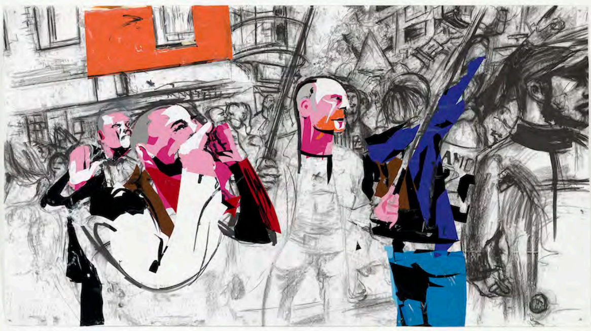
Erik van Lieshout, Untitled , 2014, Conté crayon, synthetic polymer paint, felt-tip pen, and vinyl on paper.

BY Alex Greenberger POSTED 03/17/17 5:47 PM