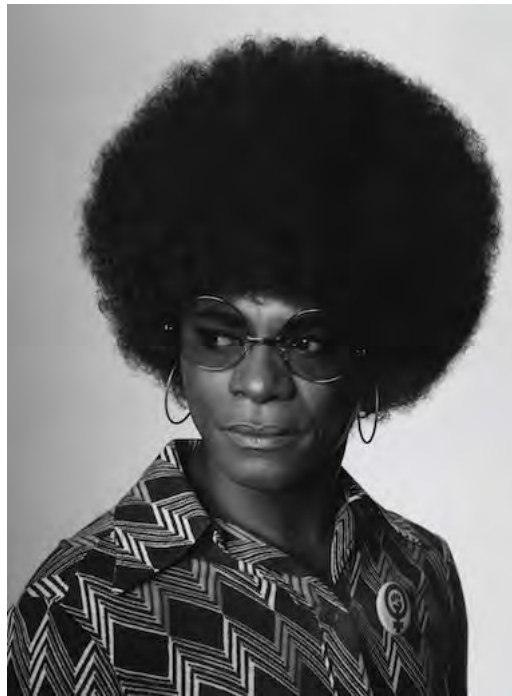
Samuel Fosso, Untitled from the series "African Spirits," 2008, gelatin silver print.

Others rely on history for inspiration. Lynette Yiadom-Boakye and Samuel Fosso both revise classical notions of portraiture to include black sitters. In his photographs, Fosso dresses like Angela Davis, Langston Hughes, and others, but markers of his own identity are clear, creating a complex statement about how truthfully a picture can capture a person, if at all. Iman Issa takes a more meta approach, offering Minimalist-minded objects—one seems like a sharpened double-sided pencil—that are actually based on ancient objects from the Middle East. Art history, these artists propose, is an unfinished conversation indeed.