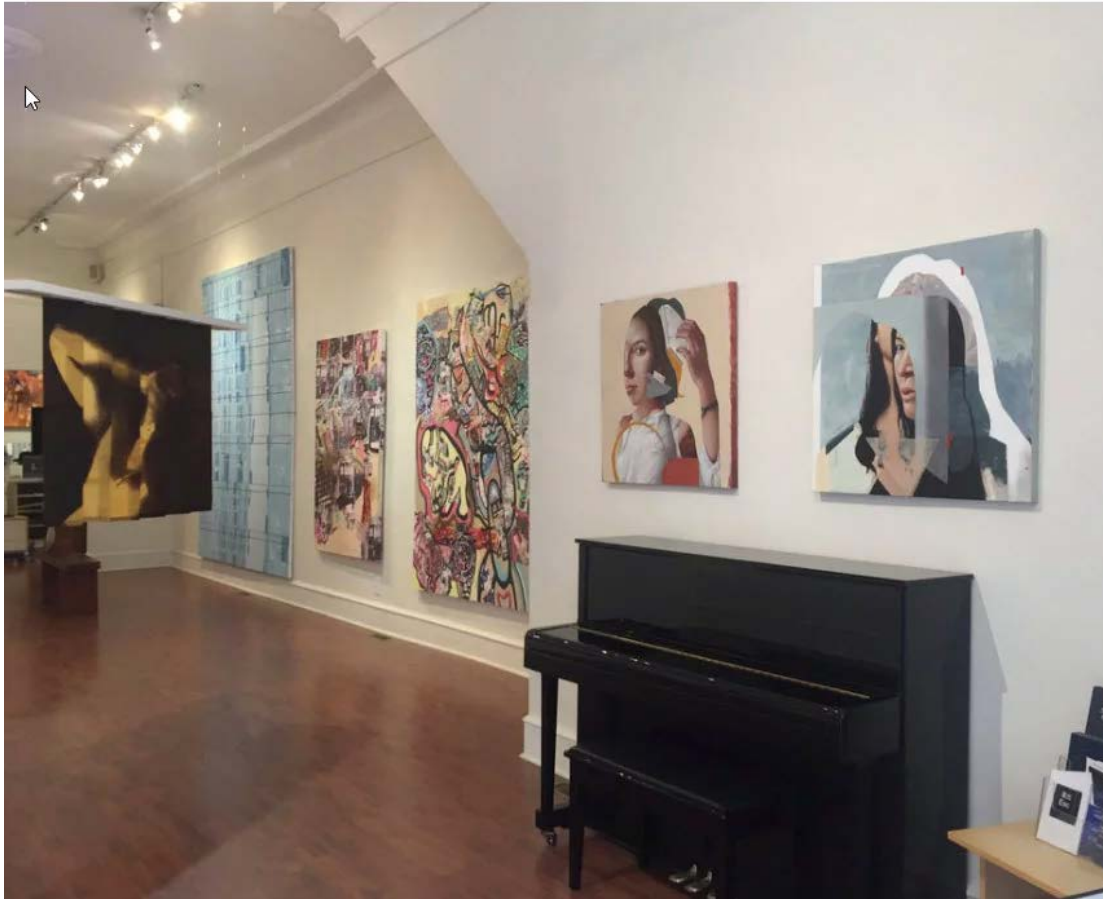
Installation view.

Where: Locks Gallery , 600 Washington Square S., Philadelphia, PA