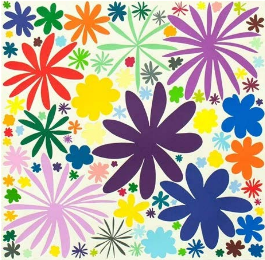
Polly Apfelbaum, Persephone (Purple) (2013).

With an art scene as old as the Liberty Bell, Philadelphia offers a diverse and vibrant array of museums and galleries. In fact, the City of Brotherly Love itself is one open-air exhibition, with over 400 public artworks lining its streets. As July comes to an end, Philly is showcasing works from American legends and newcomers alike in an exciting lineup of shows.