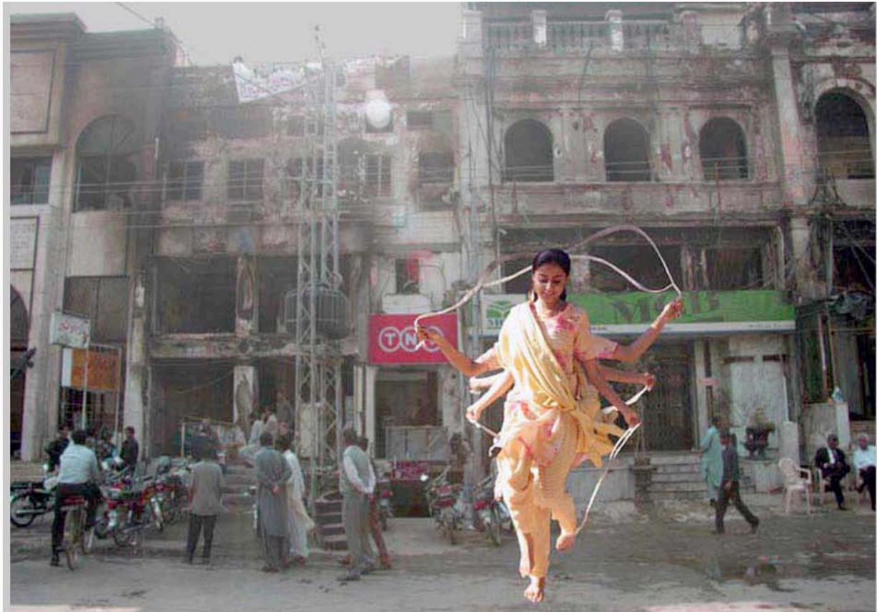
Farida Batool - Nai Reesan Shehr Lahore Diyan (2006) Lenticular print, 34 x 48 in. Edition 5/7.

NEW YORK.- aicon gallery New York presents three female Pakistani artists, Farida Batool, Tazeen Qayyum, and Adeela Suleman, in its recently relocated space on 35 Great Jones Street. During a time of great political upheaval for the country, the three women's artistic practices speak to the role of women, the tumultuous recent history, and the contemporary view of the nation and its inhabitants in the eyes of the West.