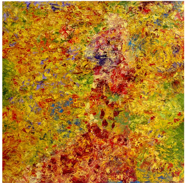
Sharmistha Ray, Fields of Gold #2 , 2013, Oil on linen, 60 x 60 in.

Ray's paintings are sites for multiple negotiations to probe the poetics of identity politics in continually shifting social and cultural parameters. Nomadically living between Mumbai and New York for close to a decade, the artist embeds a haptic sense of movement in her paintings that mirrors her physical journeys in real time and space. Grid-like structures that held paint in place here give way to more organic forms that morph into golden arcadias, beds of roses and a garden of crushed flowers. The self-reflexive voice vibrates within impasto layers of paint in City of Eros (2013), takes its form as abstracted female forms in the Fields of Gold paintings, wrestles with paint material in the Bed of Roses works and finds a tenuous resolve in A Place of Her Own (2013).