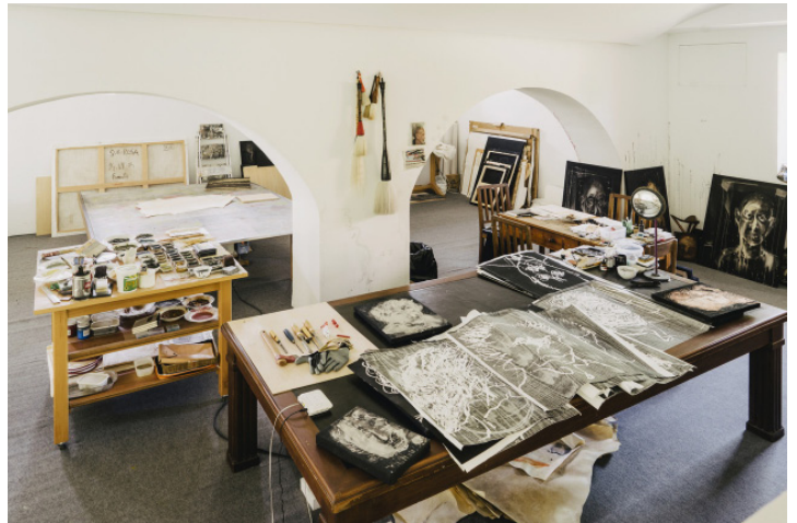
Left to Right: 1) The artist blends his own paints. 2) The tables at Miquel Barceó's paint studio at his home are neatly arranged by materials and projects.