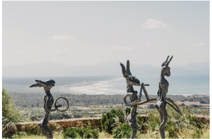
Left to Right: 1) The outside pool area offers sweeping views. 2) Some of Miquel Barceló's garden sculptures.

His own additions are subtle: a guesthouse with another two bedrooms and two bathrooms, and a painting studio. The expansion more than doubled the living space to nearly 11,000 square feet.