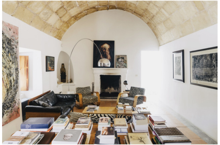
Left to Right: 1) Miquel Barceó's ceramics studio in the village of Vilafranca de Bonany. 2) The sitting room is filled with books in various languages on art and history.