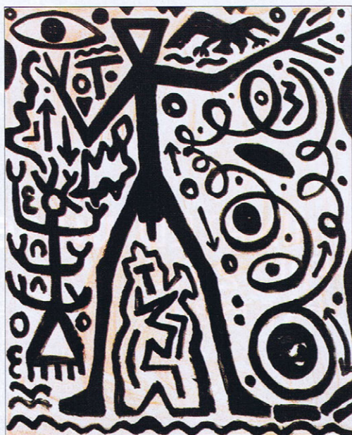
A.R. Penck, Im Fluss der Ereignisse (The Flow of Events), 2011, acrylic on canvas, 63" x 51 1/2".

Penck is unique among the German painters of the post-World War II era in that, while continuously modifying his style, he has avoided radical mutation. And, unlike the others, he has never, despite reworking themes, become tedious. A look at Im Fluss der Ereignisse (The Flow of Events), 2011, confirms this notion. Black and white, the work echoes Penck's "cave-painting" thematic, with a stylized masculine figure surrounded by possibly symbolic elements