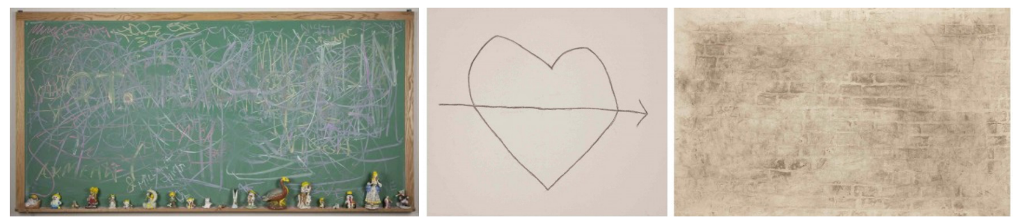
(Left to Right) The Bruce High Quality Foundation, Public Education (<3) (2013), Courtesy the artists and Vito Schnabel. Joe Bradley, Luv (2009), Courtesy the artists and Vito Schnabel. Dan Colen, Drag Your Feet (2010), Courtesy the artists and Vito Schnabel.

Assembled by the young curator Vito Schnabel (son of artist and filmmaker Julian Schnabel), White Collar Crimes, at Acquavella Galleries, brings together a collection of new abstract and conceptual works from emerging and internationally recognized artists, exploring the themes of concealment of crime by wealth, high level education and social status. Connecting conc http://artobserved. com/artimages/2013/03/acquavella_white-collar-crimes_Bradley-Luv.jpg epts such as identity, historical erosion, commercialization, and political satire, the show opens the door to complexly interconnected readings of the subjects and artists on view, while directly addressing the context and location of the event itself. According to Schnabel, the exhibition "proposes an interplay between obscure ciphers and spectacular discoveries."