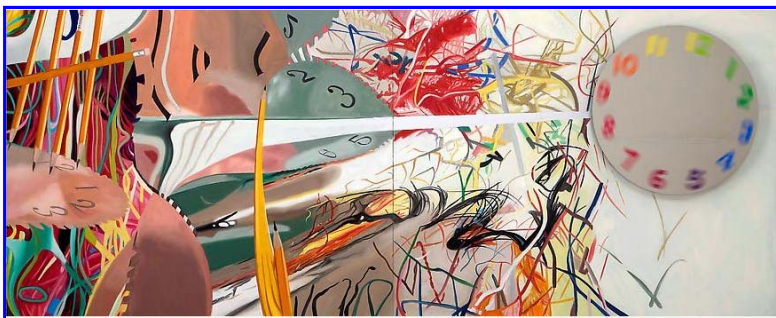
James Rosenquist, Time Stops the Face Continues , 2008. (Spinning)

These concerns have developed within the exhibition into two separate yet intertwined themes. Firstly, The Hole in the Middle of Time , which comprises seven works all of which feature clock faces that appear to melt and smash into one another. Moreover, the largest of the three have had mechanized spinning mirrors assimilated into their structure. Secondly, The Hole in the Wallpaper constitutes a series of fourteen motorized canvases, each a small-scale rendition of an earlier work. In this instance the mirrored element of each work is static whilst the canvas turns around it, thus the viewer is reflected as a constant component of the piece.