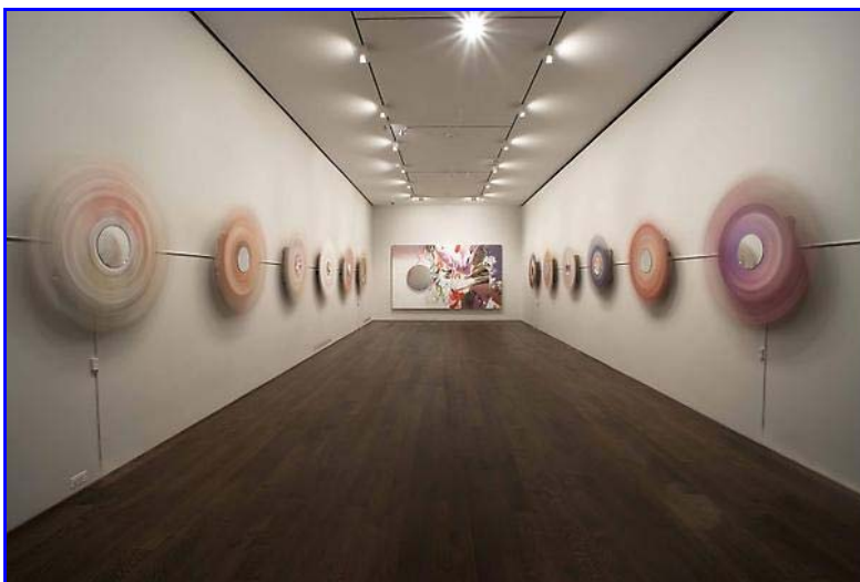
Installation view of works from “ The Hole in the Wallpaper ” series (works spinning) and “ Speed of Light Illustrated ” (2008)

Be sure to review the exhibition catalog where Rosenquist expands on all of his influences and inspiration in “ The Hole in the