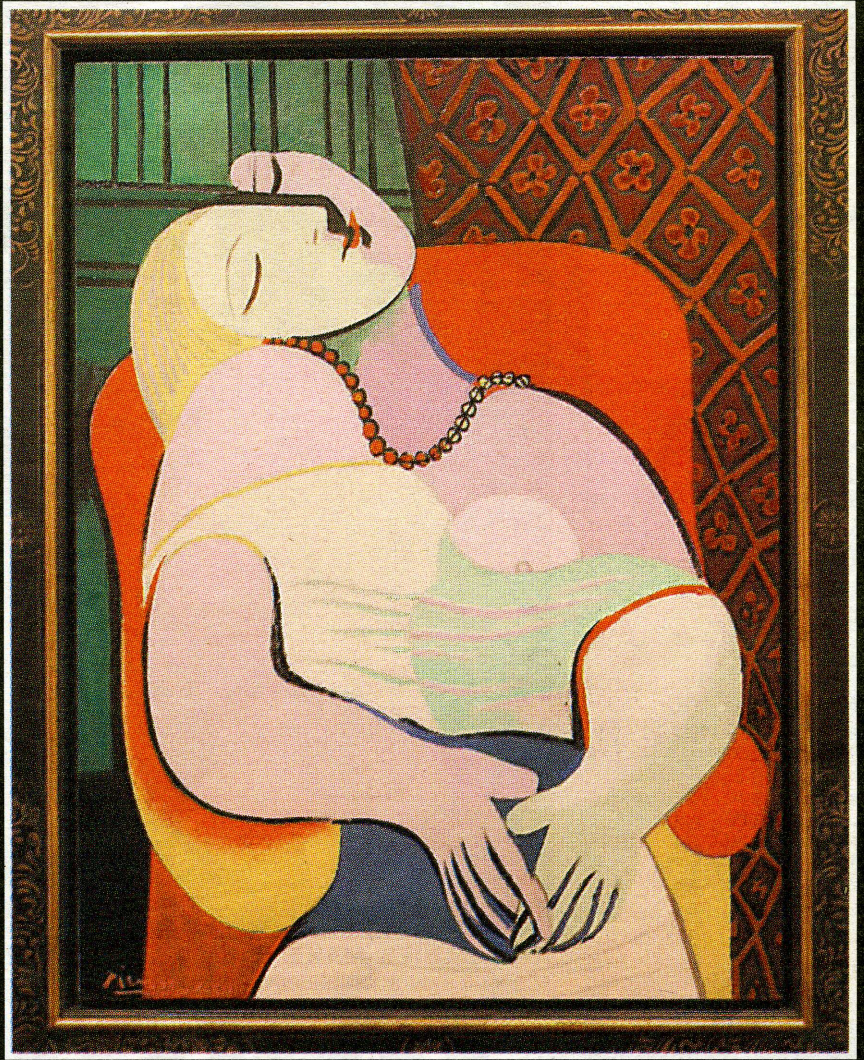
WYNNER: Steve Wynn (left) has made a mint off the Picasso (right, yesterday) he damaged.