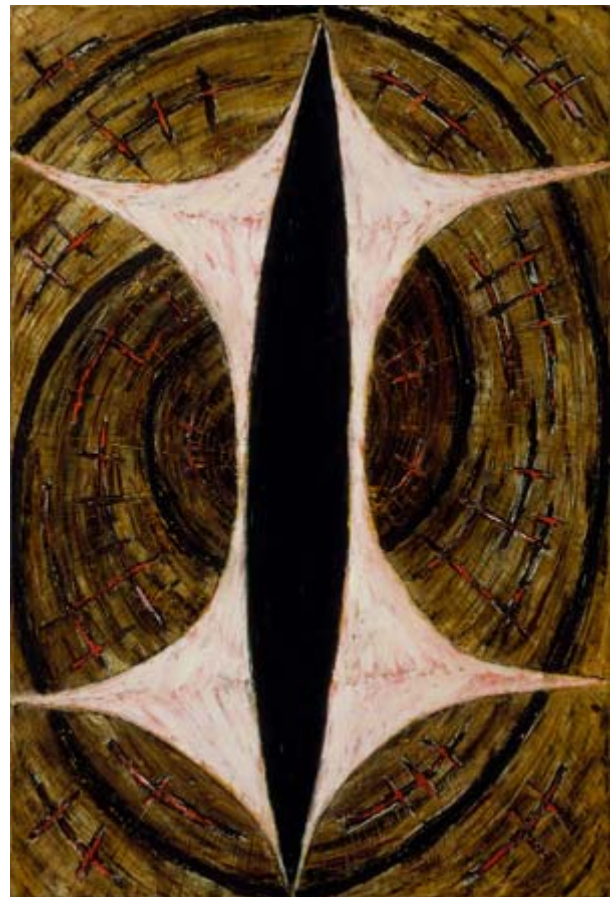
Bill Jensen, "Guy in the Dunes" (1979). Oil on linen, 36"×24".

Jensen: I built bridges from the time I was 16 years old, and at 20 I was a master carpenter. When you build concrete forms for bridges you use plywood, and I used to be mystified by these knots in the plywood. I’d see these spiral knots and see that they’d be very flat, and the next instant they have tremendous space. After graduate school I stayed in Minneapolis for nine months. I painted only on paper. Somehow these spirals kept coming out. I brought only ten oil-on-paper spiral drawings to New York. I went down to Pearl Paint and got a big canvas and I rolled it out on the floor and I knew there