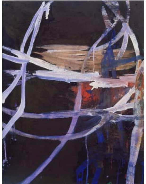
Bill Jensen, “Images of a Floating World (Diox Violet)” (2003–2005). Oil on linen, 26”×20”.

Rail: Now I know that you didn’t ever leave the city for a long time.